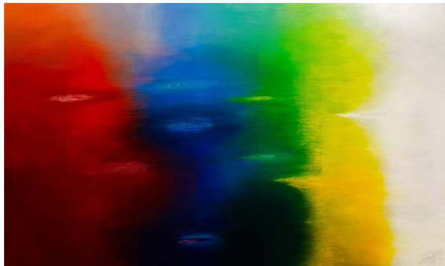
Hijrah/Hegira, 1999 Acrylic on canvas 122 x 213 cm SOLD RM 414,400