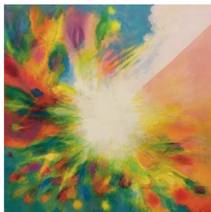
Nur Tenaga, 2010 Acrylic on canvas 153 x 152 cm SOLD RM 490,332