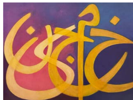
KMJSN, 2009 Acrylic on canvas 91 x 122 cm SOLD RM 280,000

Even though Datuk Syed Ahmad Jamal passed away in 2011, his contributions to the development of the local art continues to be remembered, and his art pieces remain incredibly influential and valuable.