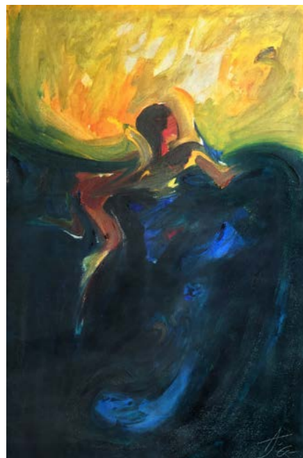
Berenang - Swimming, 1965 Oil on canvas 122 x 76 cm SOLD RM 218,400

He strongly believed that local artists were as talented as their international peers and sought to elevate the Malaysian art market, creating a platform that showcased talent and promoted recognition both locally and globally. However, being new to the local art scene, Dato' Gary Thanasan was daunted by how little he knew of the art landscape and was unsure where to begin.