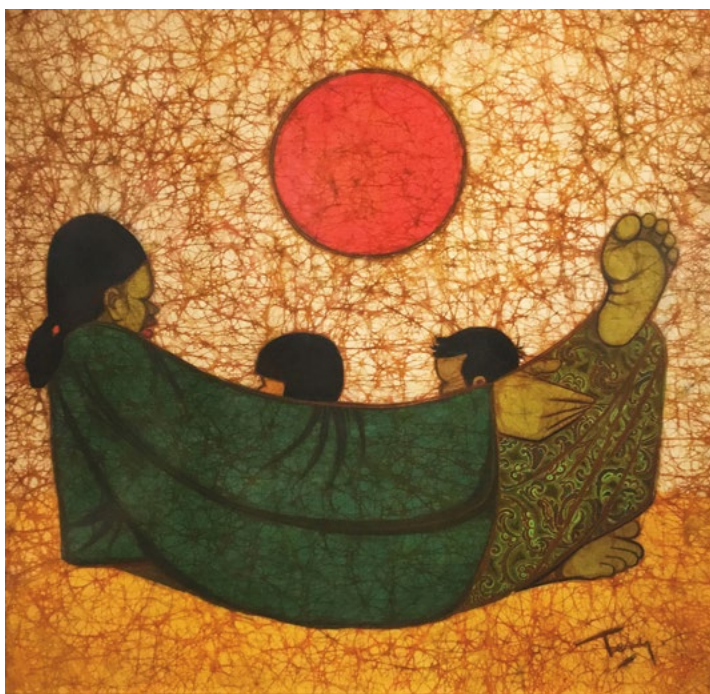
CHUAH THEAN TENG, DATO Mother and Children, 1970's Batik 83 x 85.5 cm RM 40,000 - 75,000

Khalil Ibrahim's contributions to Malaysian art are profound, with a career spanning over six decades. His works often depict the rural life of Malaysia, focusing on the East Coast's fishing communities. 'Festival 3' is a vibrant celebration of communal life, capturing the essence of traditional festivities with a modernist touch. The composition's bold colors and dynamic figures reflect Ibrahim's keen observation of social interactions and cultural rituals.