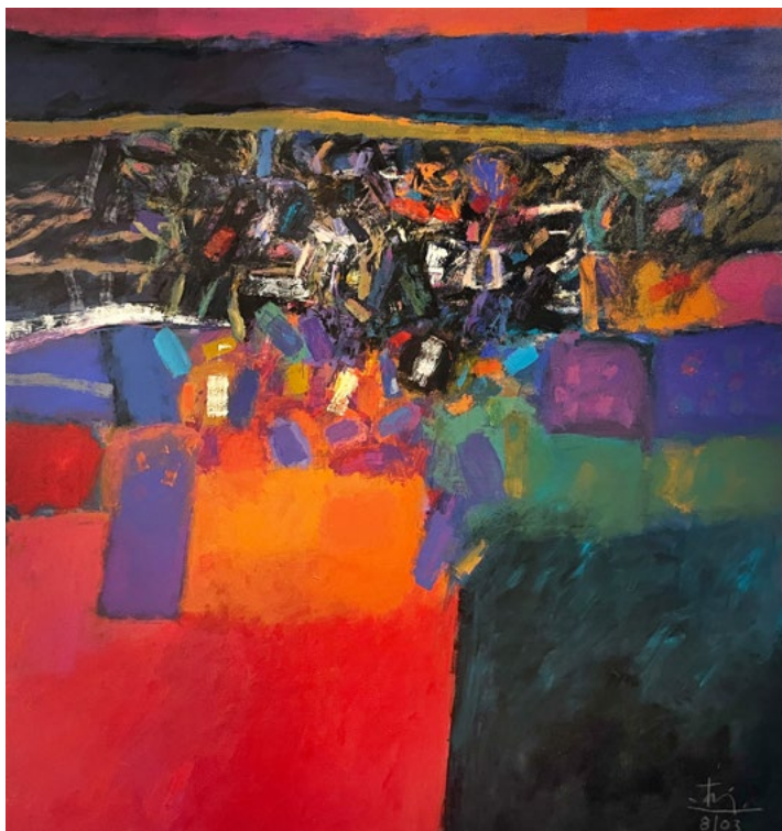
TAJUDDIN ISMAIL, DATO Balinese Garden, 2003 Acrylic on canvas 188 x 182 cm RM 60,000 - 90,000