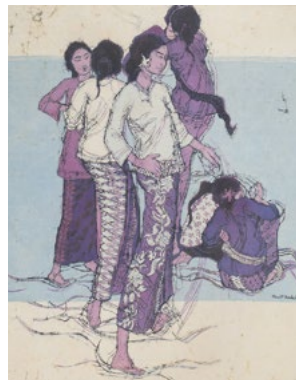
East Coast Ladies, 1973

Ibrahim's artworks have been well-received in the art market, with previous pieces achieving commendable prices. His batiks works have fetched between RM100,000 to RM150,000 in past auctions. 'Festival 3', with its rich narrative and artistic significance, is poised to attract considerable interest from collectors and institutions alike.