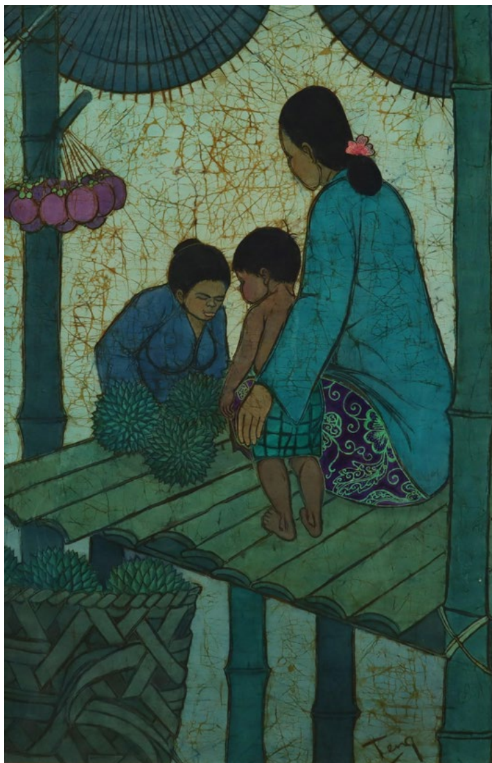
CHUAH THEAN TENG, DATO The Durian Seller, 1980's Batik 90 x 56 cm RM 30,000 - 55,000