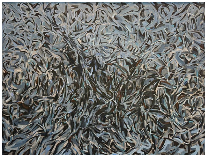
YUSOF GHANI Siri Tari III, 1984/85 Oil on canvas 163 x 219 cm RM 500,000 - 750,000