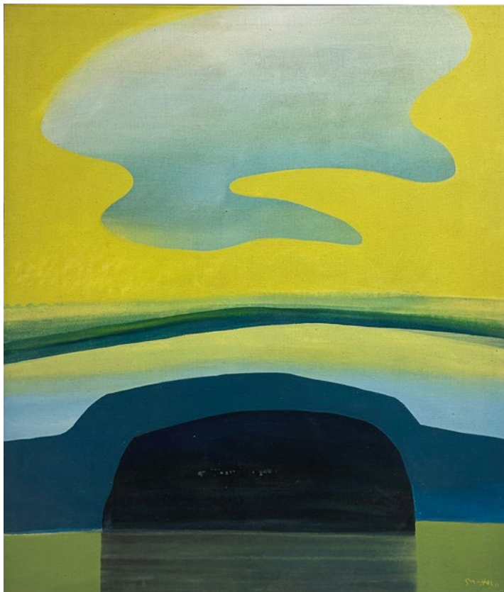
KHOO SUI HOE Bridge, 1973 Oil on canvas 95.5 x 79 cm RM 38,000 - 70,000