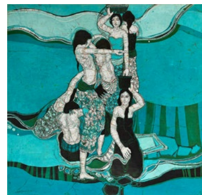
From The Well, 1976