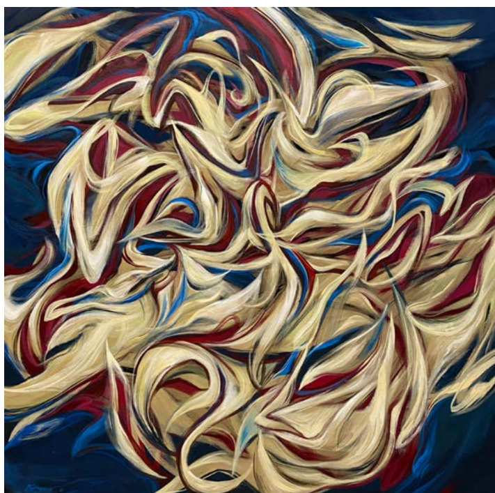
Nugraha I (Perjuangan Series), 2024