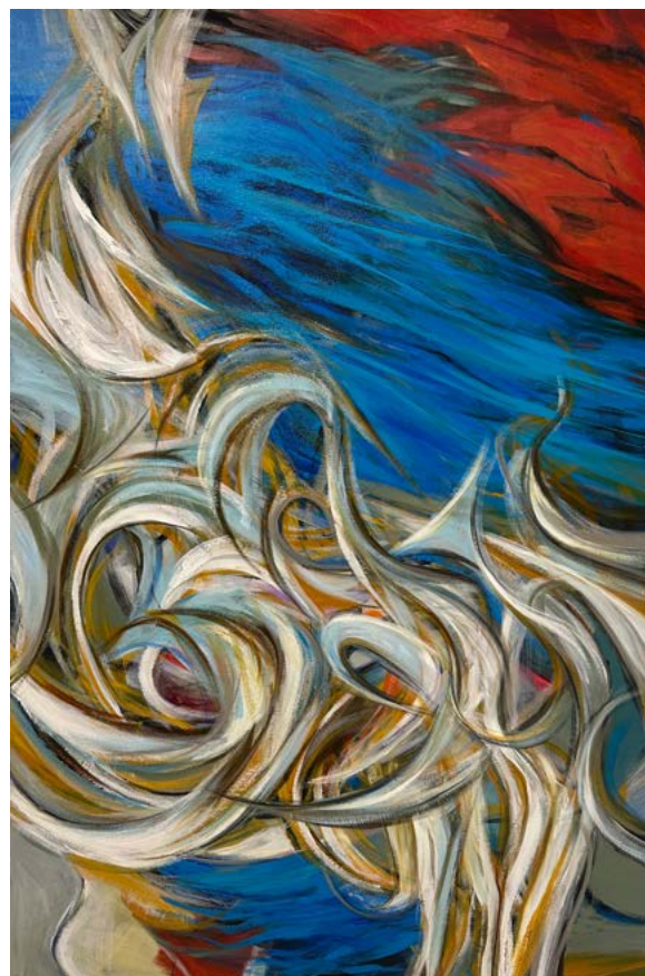
Dalam Nugraha, 2024