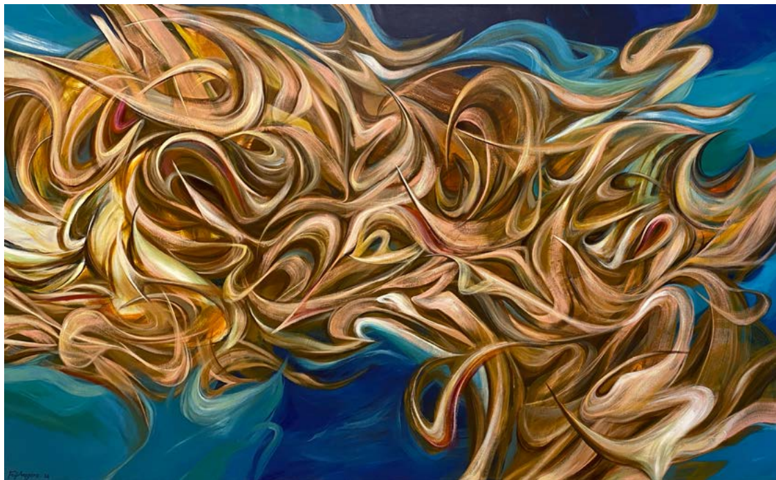
Ombak Karunia (Perjuangan), 2024