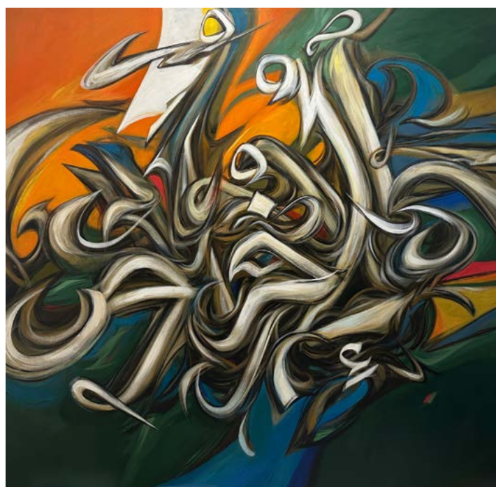
Al-Ikhlâs / Sincerity (Calligraphy), 2024