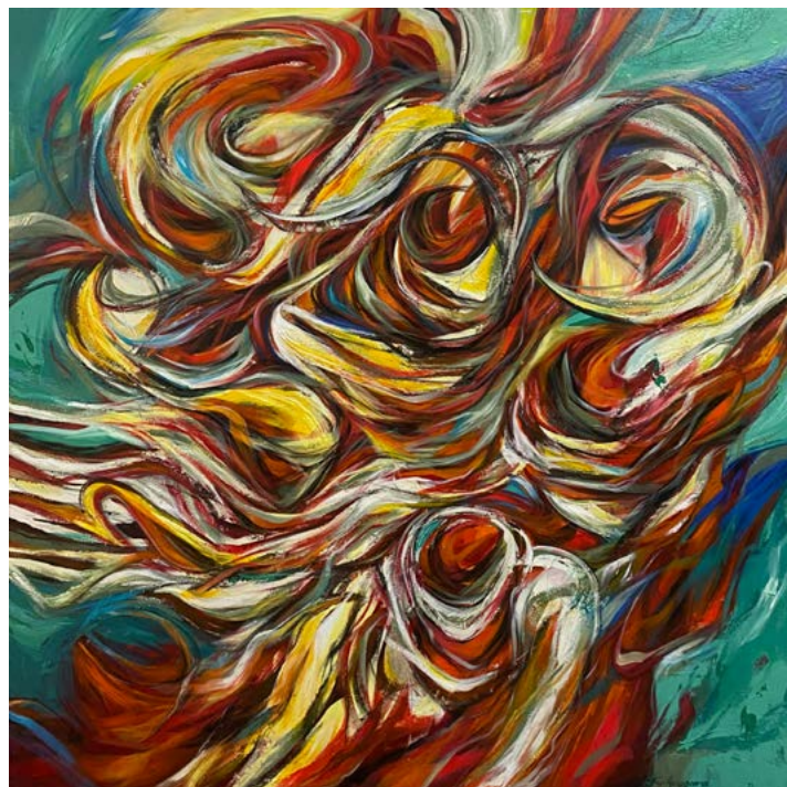
Semarak Juang, 2024

These warm colors symbolize the energy and determination required to overcome obstacles, mirroring the artist's own journey. Through this color palette, Fuji not only enhances the emotional depth of his work but also creates a visual language that speaks to the resilience and strength found in life's challenges.