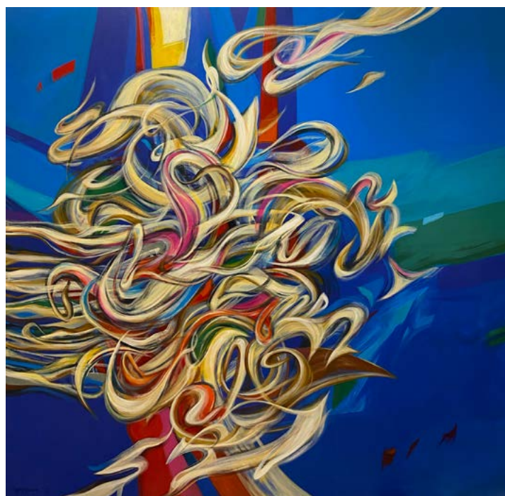
Nugraha II (Perjuangan Series), 2024 Acrylic on canvas 170 x 170 cm RM 13,800