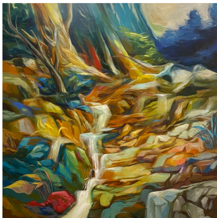
Mindscape in Nature, 2024 Acrylic on canvas 152 x 152 cm RM 12,800