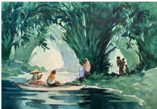
YONG MUN SEN Crossing the River Watercolour on paper 36 x 52.5 cm