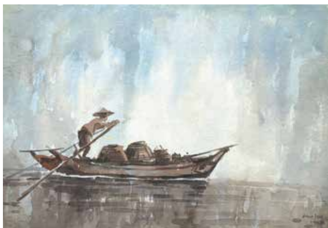
YONG MUN SEN Crossing the River, 1944 Watercolour on paper 37 x 53 cm