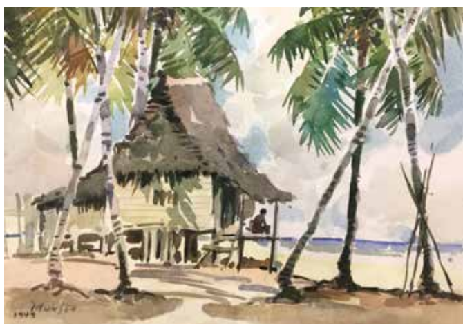
YONG MUN SEN Kampung House by the Sea, 1949 Watercolour on paper 28 x 38.5 cm