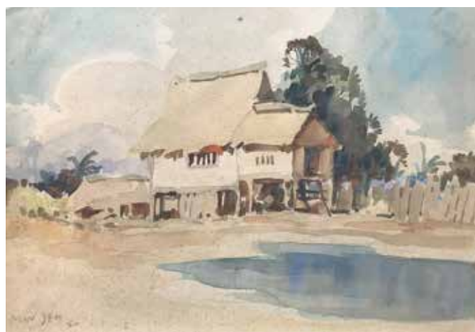
YONG MUN SEN House by a River, 1950 Watercolour on paper 39 x 28 cm