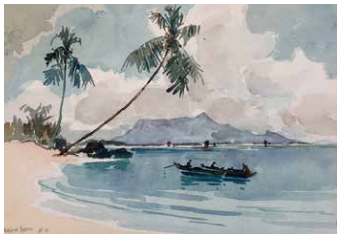
YONG MUN SEN Penang Beach Scene, 1956 Watercolour on paper 27 x 38 cm