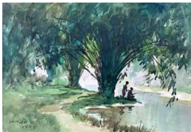
YONG MUN SEN By the River, 1949 Watercolour on paper 38 x 56 cm