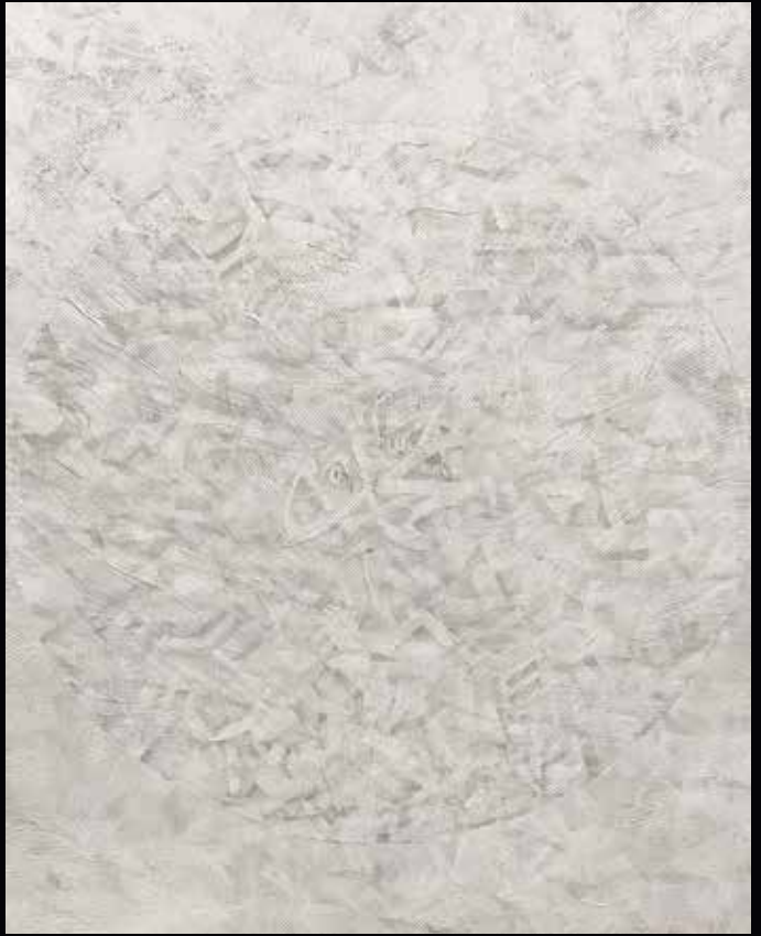
Nizar Kamal Ariffin Allah , 2019 acrylic on canvas 122 x 91 cm