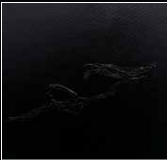
Amir Amin Ha-Mim , 2021 acrylic on canvas 30.5 x 30.5 cm