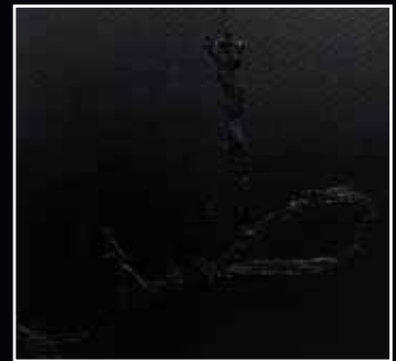
Amir Amin Tho-Sin-Ra , 2021 acrylic on canvas 30.5 x 30.5 cm