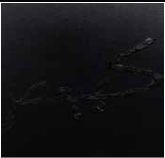
Amir Amin Kaf-Ha-Ya-Ain-Sod , 2021 acrylic on canvas 30.5 x 30.5 cm