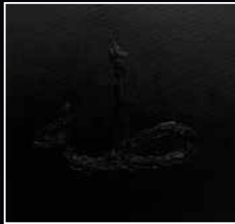
Amir Amin Tho-Ha , 2021 acrylic on canvas 30.5 x 30.5 cm