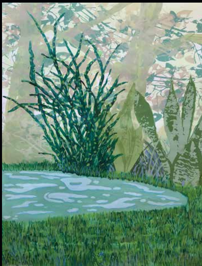
Luqman Nur Zainal Lake Garden II , 2023 acrylic on paper 85 x 85 cm

The ground floor will serve as a permanent space dedicated to the permanent display of artworks by Malaysian and regional masters such as Khalil Ibrahim, Datuk Ibrahim Hussein, Chen Wen Hsi, Datuk Chuah Thean Teng and Yusof Ghani to name a few, exclusive for purchase under Private Sale. The first floor is primarily where art auctions are conducted. Outside the auction calendar, the space is divided into four rooms — Project Room 1 & 2, Project Room 3 and Project Room 4 respectively, for hosting solo and group exhibitions.