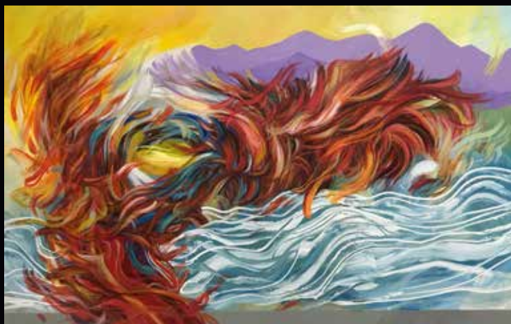
Fuji Anggara Balada Ombang, 2023