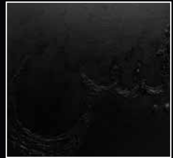
Amir Amin Ya-Sin , 2021 acrylic on canvas 30.5 x 30.5 cm