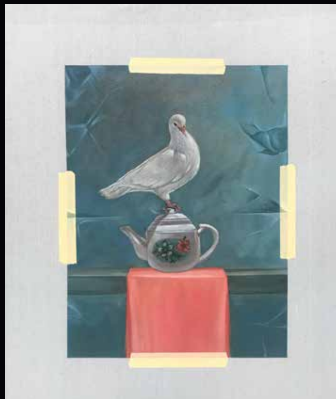
Nazreen Nor Merpati Putih