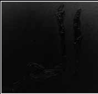
Amir Amin Alif-Lam-Mim , 2021 acrylic on canvas 30.5 x 30.5 cm