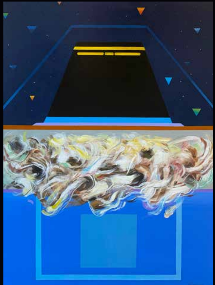
Fuji Anggara Impian Hakiki , 2023 acrylic on canvas 109 x 175 cm