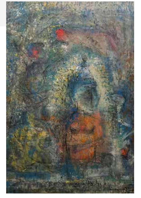
Paritosh Sen Ragini Asavari, 1961 Oil on panel 90 x 60 cm SOLD RM 31,920

Art collectors and interested buyers are welcomed to visit KLAS PLUS @ 150 Jalan Maarof, and its website at www. kl-lifestyle.com.my for the latest news. For any enquiries, please contact Nik at 019 333 7668 or the office at 013 361 2668. You can also send your requests to info@ mediate.com.my