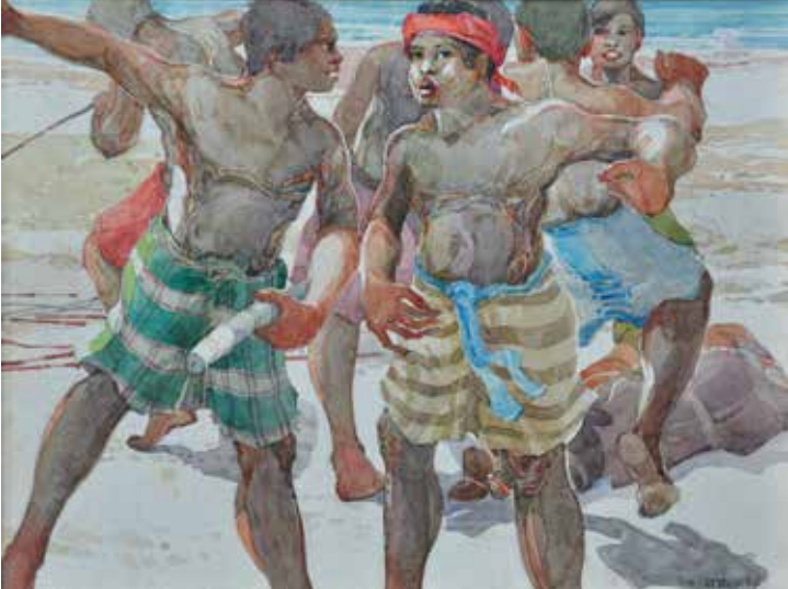
Khalil Ibrahim East Coast Fishermen, 1988 Watercolour on paper 25 x 33.5 cm SOLD RM 6,160

Khalil Ibrahim Form XXIII, 2000 Acrylic on canvas 95 x 99 cm SOLD RM 56,000