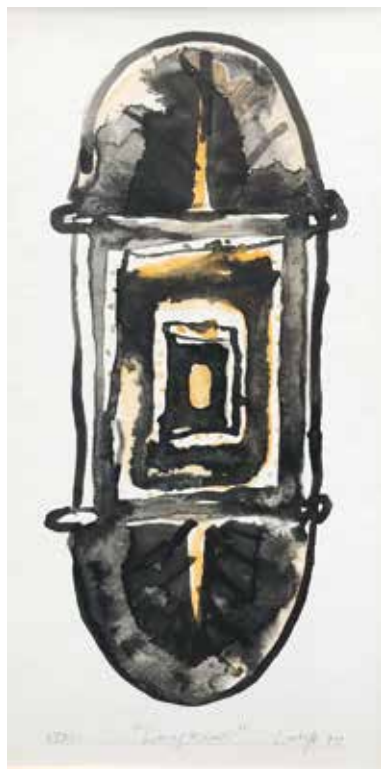
Abdul Latiff Mohidin Siri Langkawi (USM), 1979 Mixed Media on paper 19 x 10.5 cm