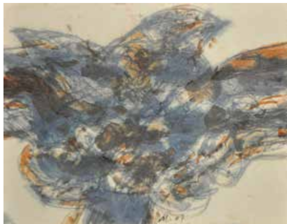
Abdul Latiff Mohidin "Pago-Pago Series" (1967) Mixed Media on Paper 9.5cm x 12.5cm

Perhaps the most striking thing about Mohidin's works on paper is the way in which they reflect his deep connection to the natural world. His use of organic forms and motifs is a testament to his love of nature, as well as his belief in the importance of preserving the environment for future generations. Through his exploration of traditional Malay forms and motifs, as well as his deep connection to the natural world, Mohidin has created a body of work that is both beautiful and deeply meaningful. His contributions to the world of art have cemented his place as one of Malaysia's most celebrated artists, and his works on paper remain a testament to his enduring legacy.