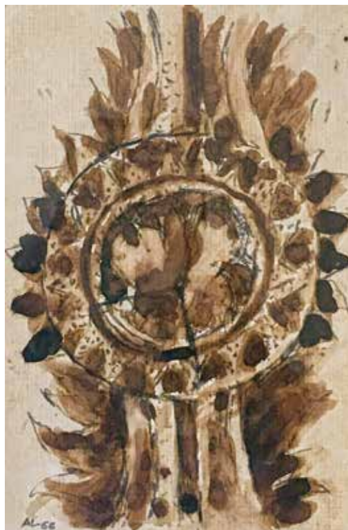
Abdul Latiff Mohidin Siri Pago Pago, Bangkok (1966) Pen on paper 16 x 10.5 cm