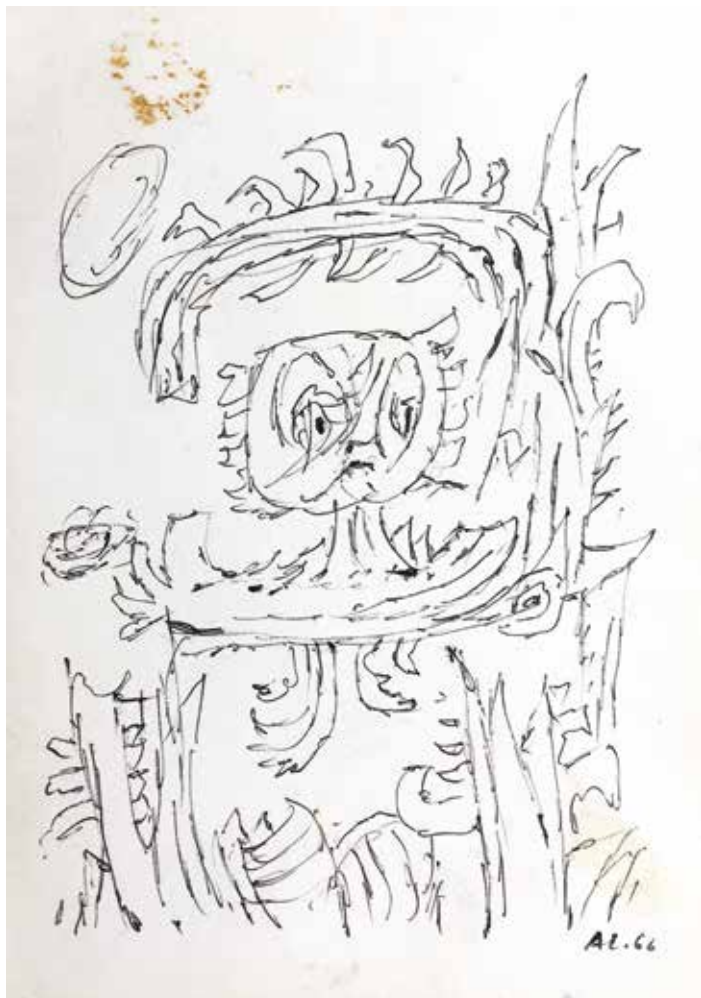
Abdul Latiff Mohidin Siri Pago Pago, 1966 Pen on paper 15 x 10.5 cm