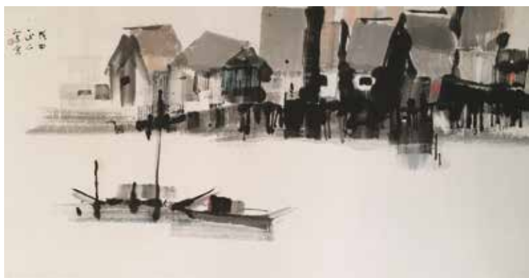
Chung Chen Sun Fishing Village, 1970's Ink and colour on paper 77 x 116 cm