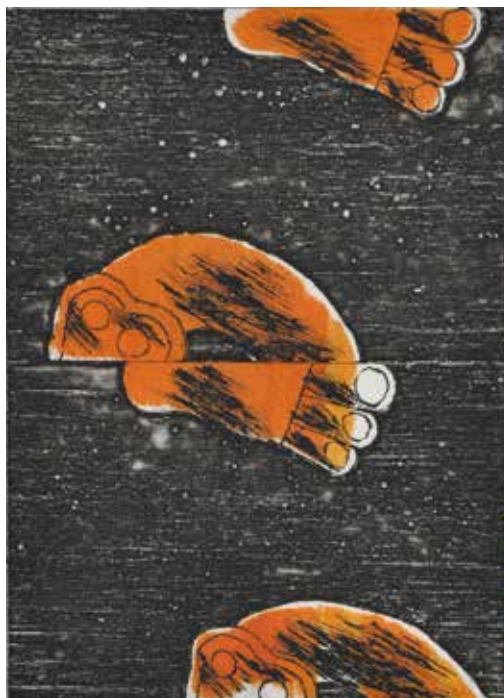
Abdul Latiff Mohidin New York, 1969 Etching 8/13 30cm x 21cm

As an artist, Latiff has been active since 1951 and has shaped and moulded the art scene in Malaysia with his bodies of work. The artist's oeuvre stretches from modern painting to poetry and literature. From as early as the 1970's when he emerged onto the Malaysian art and literary scene with the collective, Kumpulan Anak Alam (Collective of Children of Nature) which counted amongst their activities performances and poetry recitals. Latiff has consistently found inspiration in nature. His breakout series of visual works, Pago-Pago, focusing on nature and monuments in Southeast Asia. More conceptual works followed, before the Voyages series of the 2000's where he maintains an insatiable curiosity about the world around him.