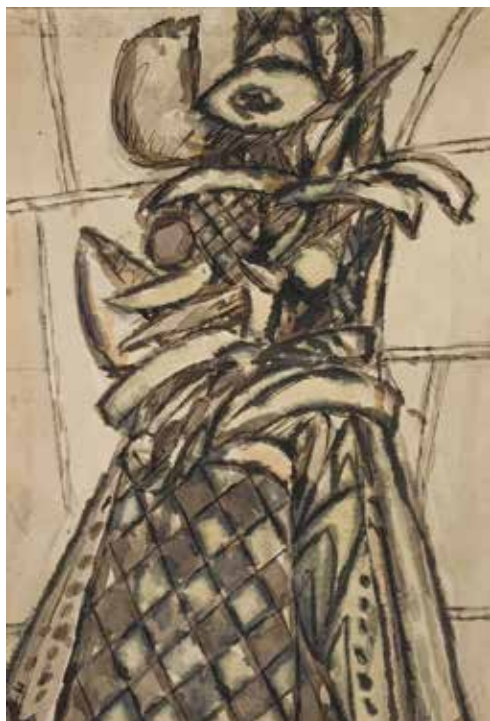
Abdul Latiff Mohidin Pago-Pago Series "Kelantanese Harlequin", 1968 Mixed media on paper 24 x 16 cm