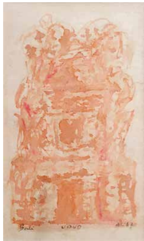
Abdul Latiff Mohidin Siri Pago Pago 'Ubud' 1967 Mixed media on paper 16.4 x 9