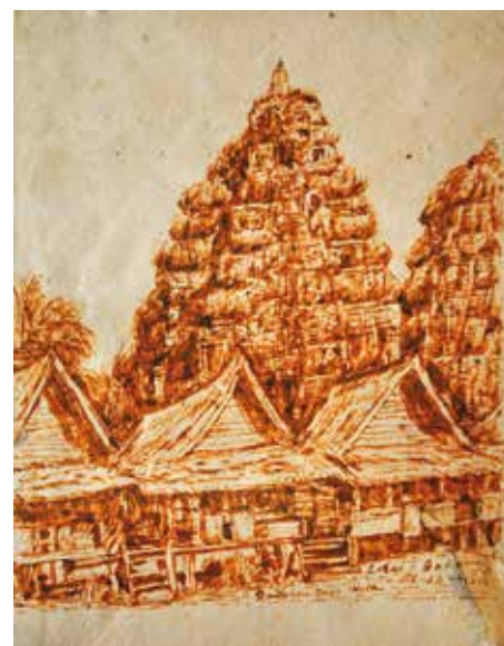
Abdul Latiff Mohidin Zwischen Zwei Welten (In Between Two Worlds) 1966 Ink on paper 16 x 11.5 cm