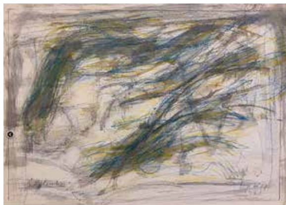
Abdul Latiff Mohidin Gelombang, 1993 Mixed media on paper 20 x 29 cm