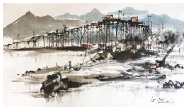
Chung Chen Sun Tin Mine, 1970's Ink and colour on paper 41 x 116 cm