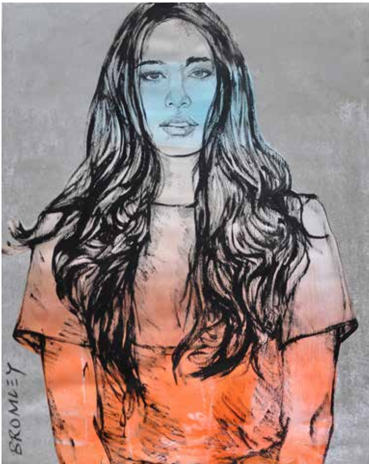
David Bromley Chanela, 2017 Acrylic on canvas with metal leaf gilding 150 x 120 cm