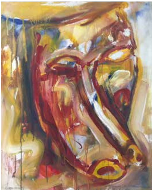
Yusof Ghani Topeng Series, 1996 Acrylic on canvas 61 x 76 cm