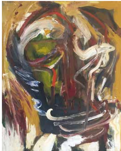
Yusof Ghani Topeng Series, 1996 Acrylic on canvas 61 x 76 cm