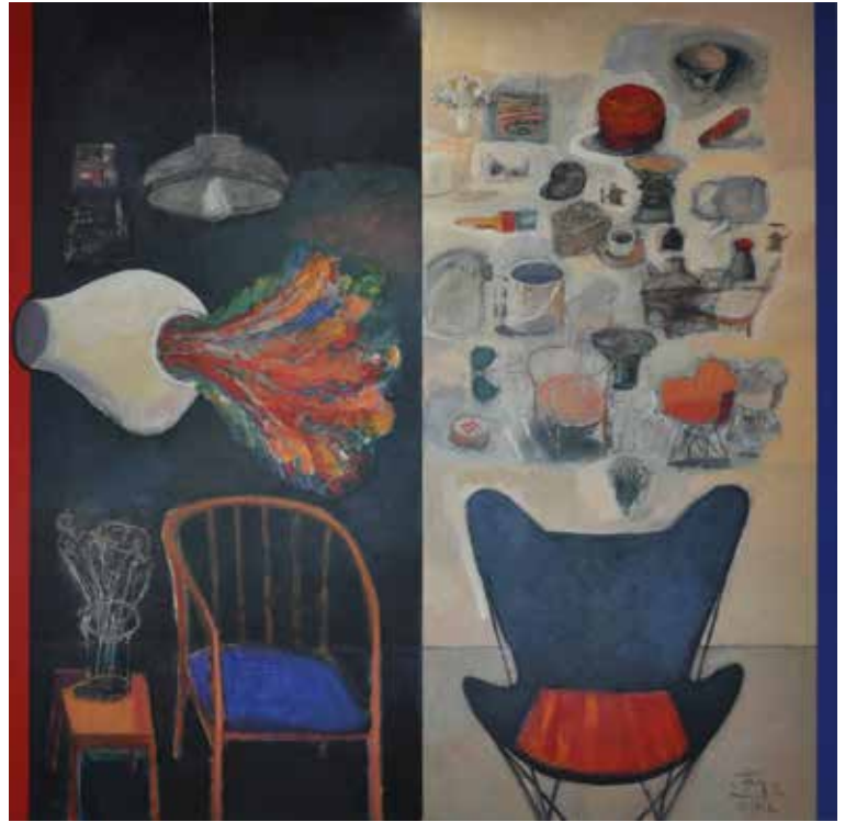
Tajuddin Ismail, Dato Studio Interiorscape, 2002 Acrylic on board 240 x 240 cm