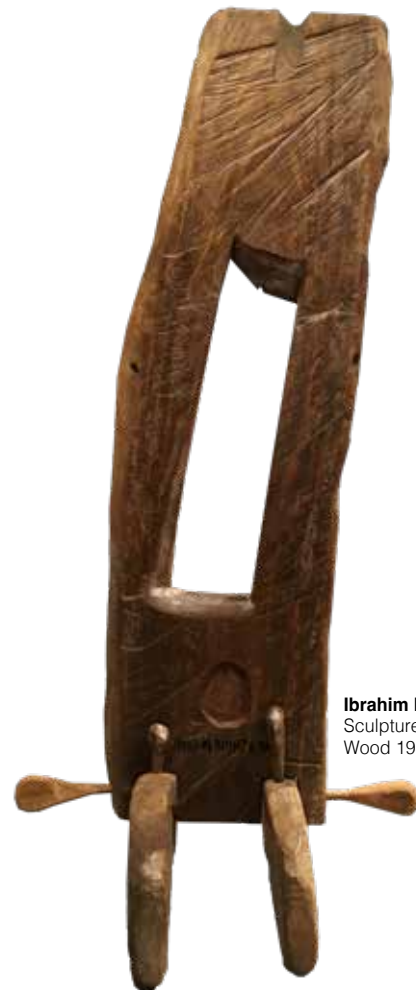
Ibrahim Hussein, Dato Sculpture, 1998 Wood 194.5 x 91 x 64.5 cm