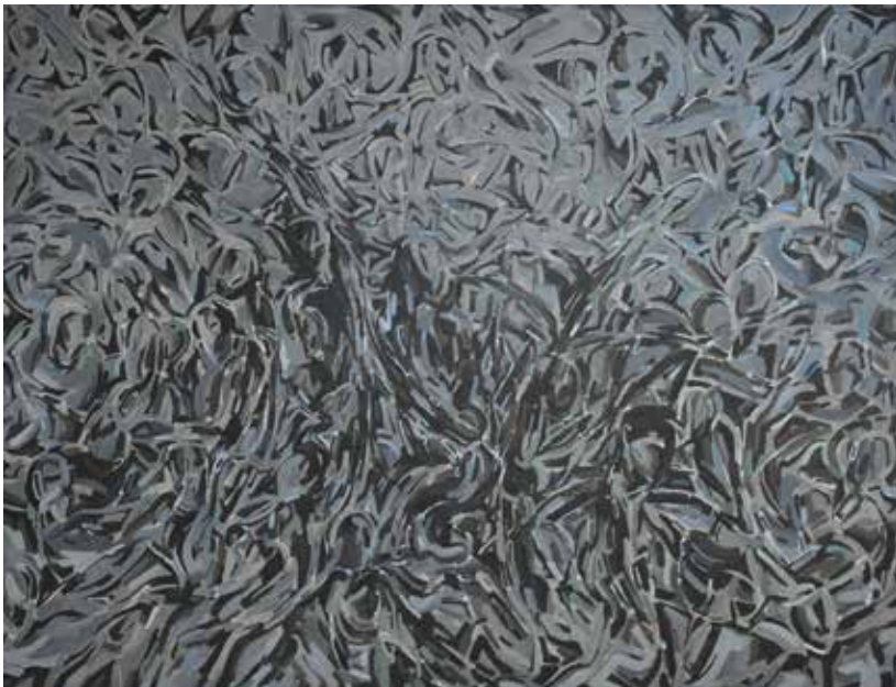
Yusof Ghani Siri Tari III (1984-85) Oil on canvas 163 x 219 cm