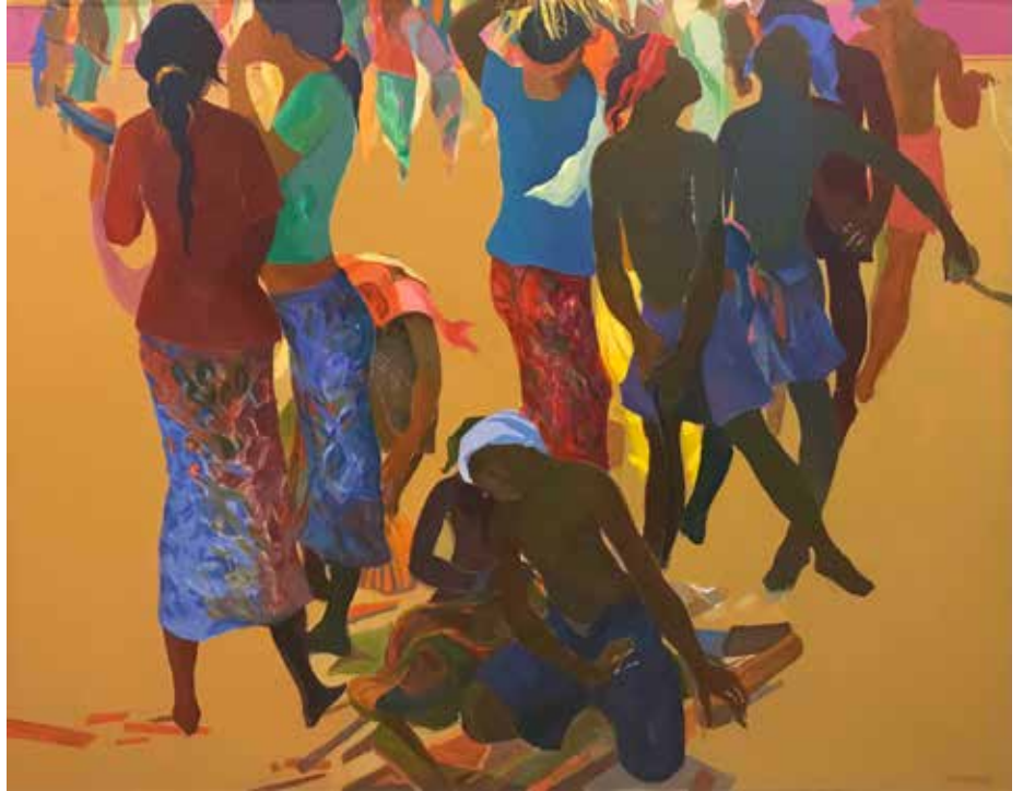
Khalil Ibrahim East Coast Series, 2004 Acrylic on canvas 130 x 166 cm