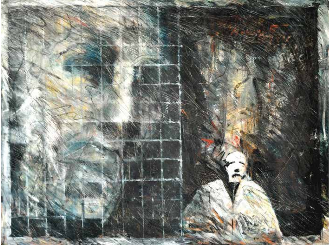
Yusof Ghani Protest Series Washington, USA - We are in the system, 1983 Oil on canvas 118 x 158 cm