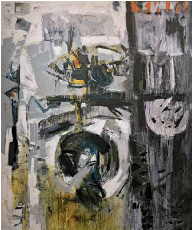
Awang Damit Ahmad EOC Musim Kelabu, 1995 Mixed media on canvas 183 x 153 cm