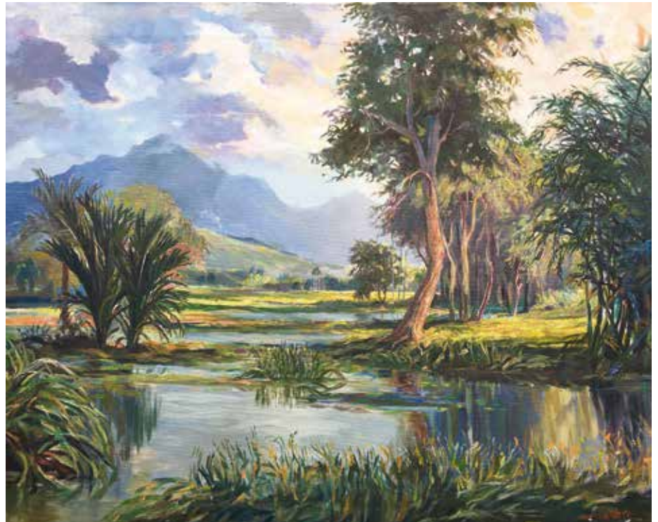
Khalil Ibrahim Imaginary East Coast Landscape, 1997 Oil on canvas 60 x 73 cm