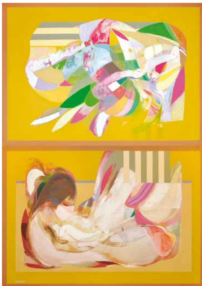
Ibrahim Hussein, Datuk Now and Again It Flowers, 1973 Acrylic on canvas 258 x 183 cm