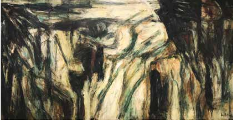
Abdul Latiff Mohidin Rimba Series - Puntung The Stump, 1996 Oil on canvas 137 x 266 cm

This Private Sales presented by KLAS provide the avenue for busy cosmopolitans and art aficionados who lack time to view the array of artworks online and later purchase them at the gallery. Artworks showcased here are consigned specifically for the private sales and its prices are of nett value. Visit the following link for images of the artworks, for your viewing pleasure, https://www.kl-lifestyle.com.my/private-sale-2020/ . Feel free to also visit our physical gallery, KLAS Plus at 150, Jalan Maarof, Bangsar.