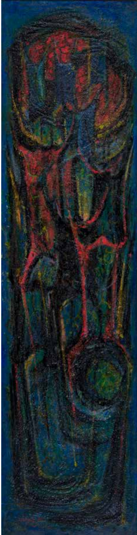
Cheong Lai Tong Abstract, 1962 Oil on board 265.5 x 67 cm