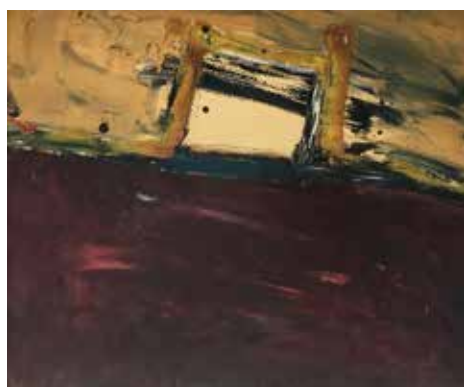
Yusof Majid Storm, 2002 Oil on paper, 24 x 29 cm RM 1,000 - 2,500