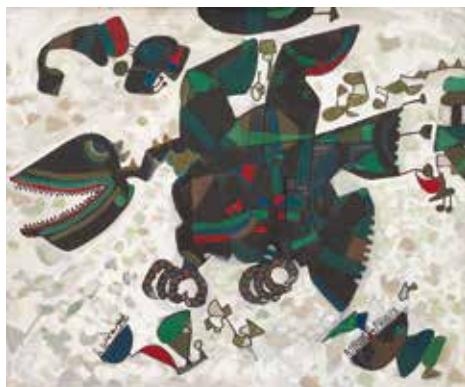
Haji Widayat Burung Phoenix Oil on board, 50 x 59.5 cm RM 15,000 - 30,000