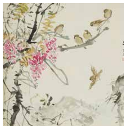
Chen Wen Hsi Sparrows and Cherry Blossom Ink on paper, 68 x 68 cm RM 25,000 - 45,000