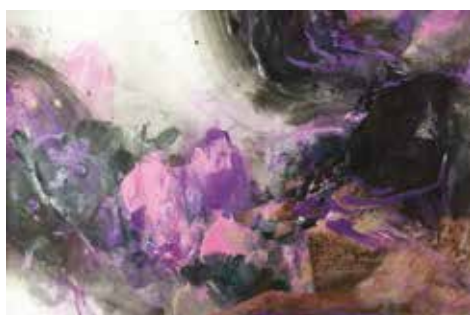
Soon Lai Wai Purple Earth, 2021 Oil on canvas, 165 x 165 cm RM 14,000 - 25,000