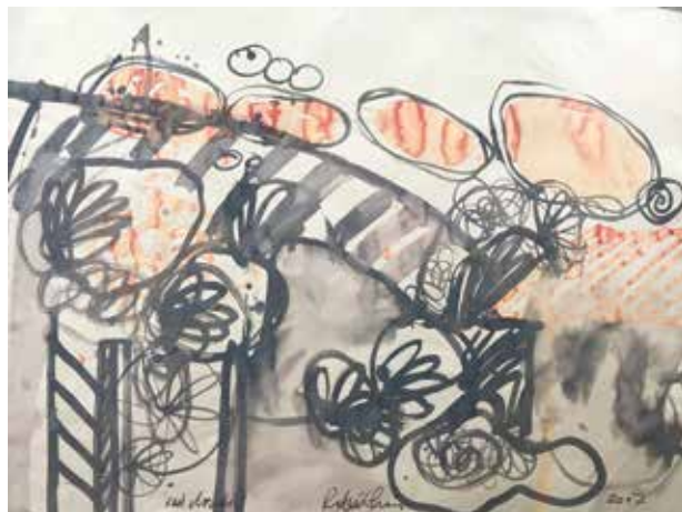
Rafiee Ghani Red Clouds, 2007 Mixed media on paper, 88 x 118 cm RM 2,500 - 5,000