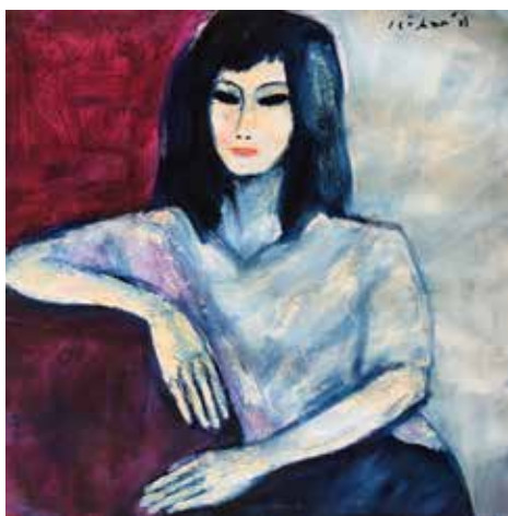
Jeihan Sukmantoro Mariam, 2011 Oil on canvas, 70 x 70 cm RM 6,000 - 12,000