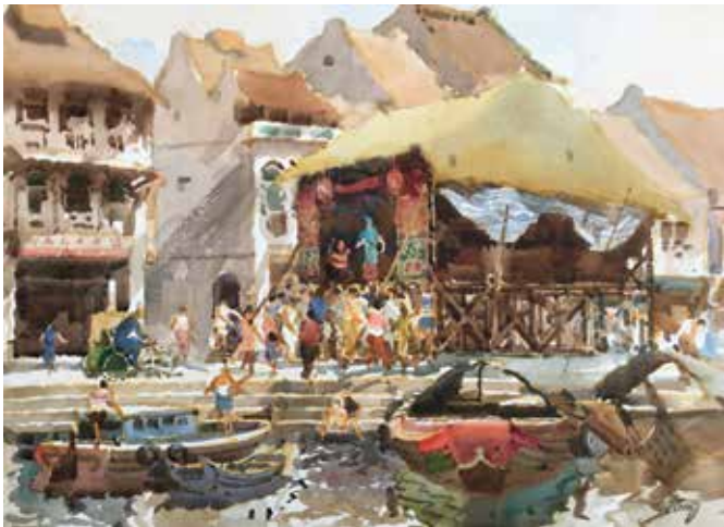
Tong Chin Sye Market in Boat Quay, Singapore Watercolour on paper, 37 x 51 cm RM 10,000 - 18,000