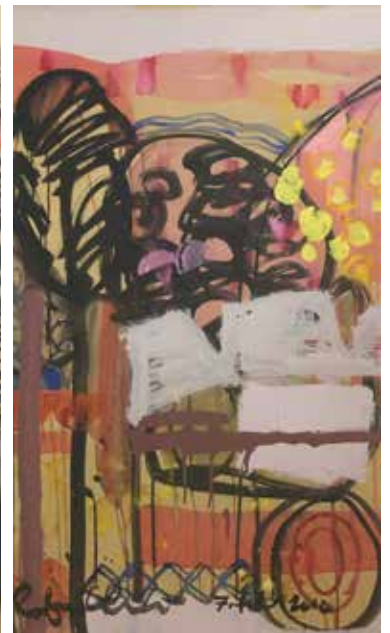
Rafiee Ghani Fushia, 2010 Watercolour on paper, 91 x 53 cm RM 2,500 - 7,000