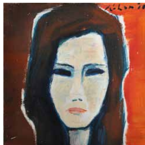
Jeihan Sukmantoro Dewina, 2010 Oil on canvas, 45 x 45 cm RM 3,500 - 7,000