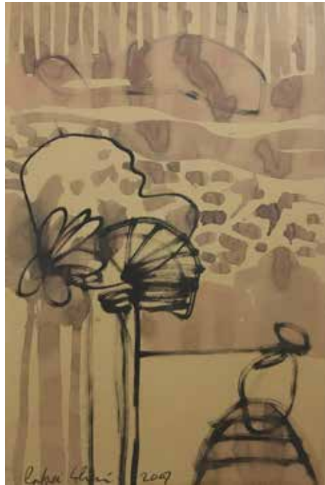
Rafiee Ghani Lotus, 2007 Mixed media on paper, 91 x 61.5 cm RM 1,500 - 3,500