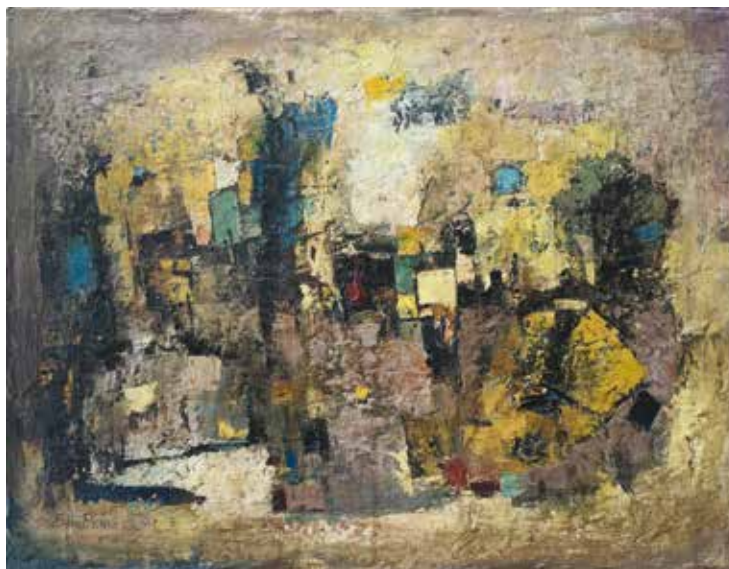
Cheong Soo Pieng Fishing Village, 1960's Oil on mesonite board, 50 x 70 cm RM 150,000 - 300,000