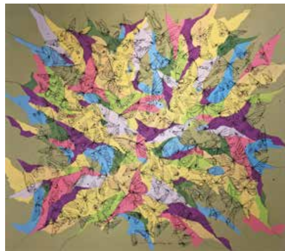
Mohd Khairul Izham Terbang, 2019 Acrylic on canvas, 135 x 152 cm RM 1,500 - 3,500