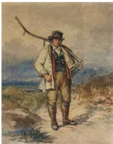
David Cox Worker with scythe in a Landscape Watercolour on paper, 28.8 x 22.5 cm RM 2,400 - 5,500