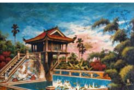
Truong Van Thanh Chùa Một Cột - The One Pillar Pagoda in Hanoi Lacquer on board, 41 x 61 cm RM 4,000 - 9,000