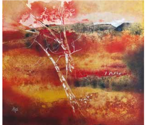
Thomas Yeo Landscape Mixed media on paper laid on board, 52 x 59 cm RM 2,000 - 6,000