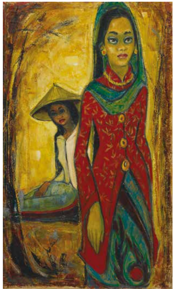
Ng Eng Teng The Old and New Dress of the Malaysian Lady, 1960 Oil on canvas, 87 x 50.5 cm RM 25,000 - 45,000