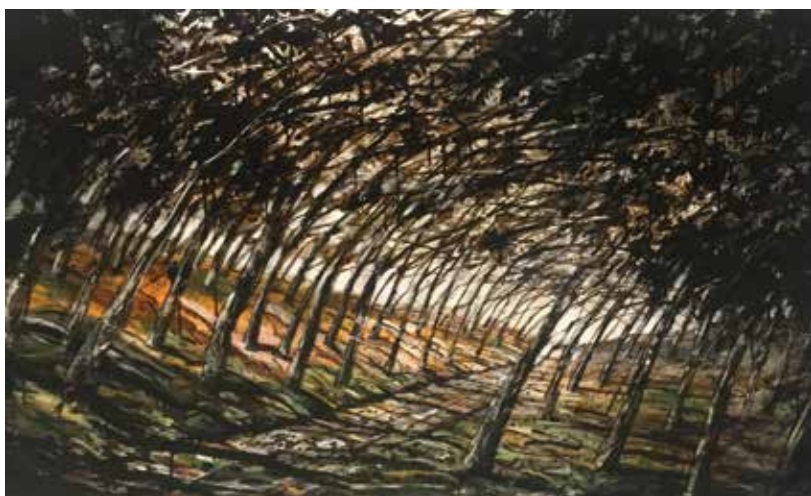
Jailani Abu Hassan Kebun Getah Series, 2018 Oil on canvas, 92 x 152 cm RM 12,000 - 22,000