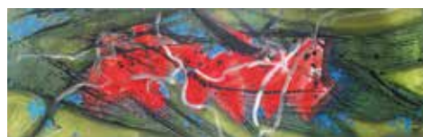
Raphael Scott Ahbeng Windy Day, 2010 Oil on canvas, 38 x 121 cm RM 6,500 - 12,000