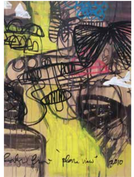
Rafiee Ghani Plane View, 2010 Watercolour on paper, 66 x 47 cm RM 800 - 2,200