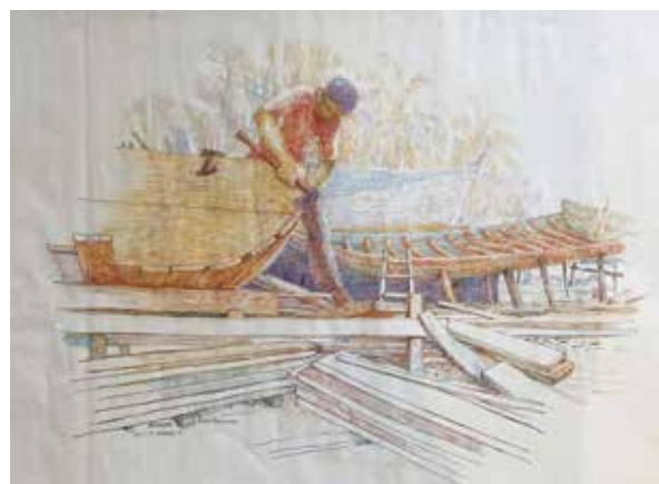
Khalil Ibrahim Boat Builder, 1985 Watercolour on paper, 38 x 50 cm RM 6,000 - 12,000