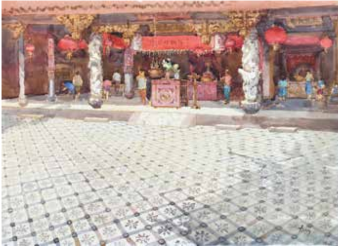
Tong Chin Sye Thian Hock Keng (Temple of Heavenly Happiness) in Teluk Ayer Street, Singapore Watercolour on paper, 53.3 x 73.66 cm RM 10,000 - 18,000