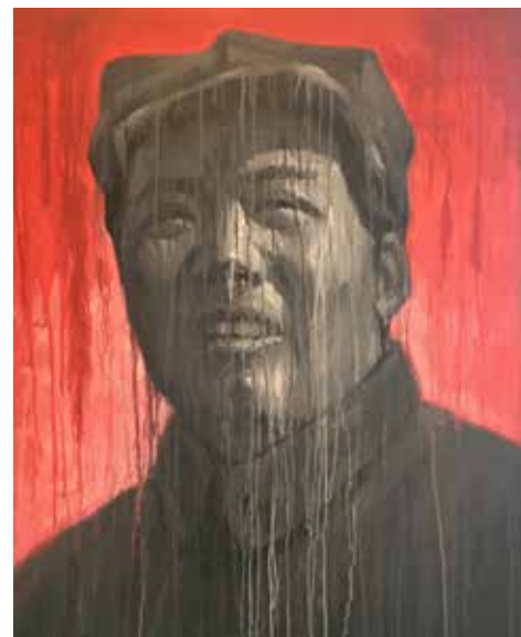
Sheng Qi Mao - Red and Black, 2007 Acrylic on canvas, 99 x 80 cm RM 7,000 - 15,000