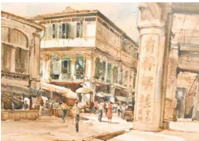
Ong Kim Seng Terengganu Street on Rest Day, 1980 Watercolour on paper, 50 x 71 cm RM 15,000 - 30,000