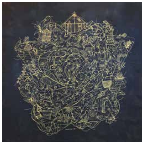
Mohd Khairul Izham Golden Rose, 2020 Acrylic on canvas, 152 x 152 cm RM 1,000 - 3,000