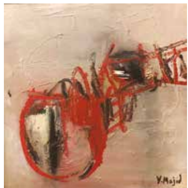
Yusof Majid Abstract, 2002 Oil on canvas, 43.5 x 43.5 cm RM 3,500 - 5,000