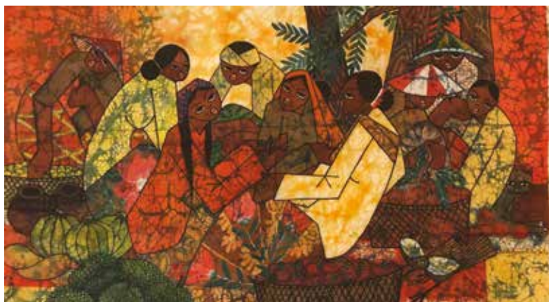
Kwan Chin Fruit Sellers, 2003 Batik, 84 x 145 cm RM 10,000 - 22,000