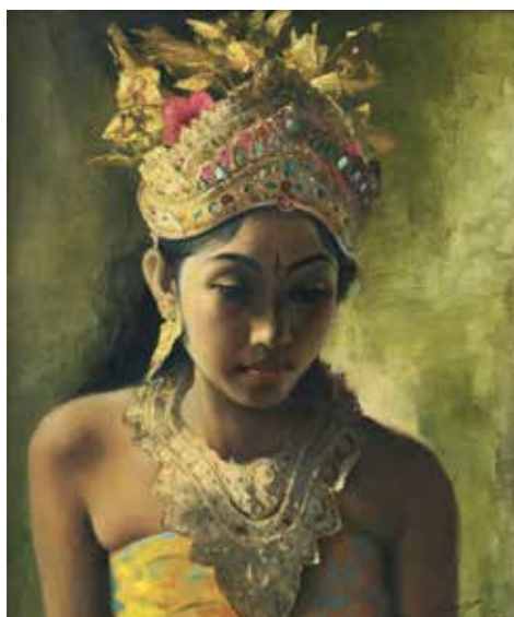
Dullah Dayu Wazsiki (Tambulilingan Dancer), 1975 Oil on canvas, 59 x 49 cm RM 15,000 - 30,000