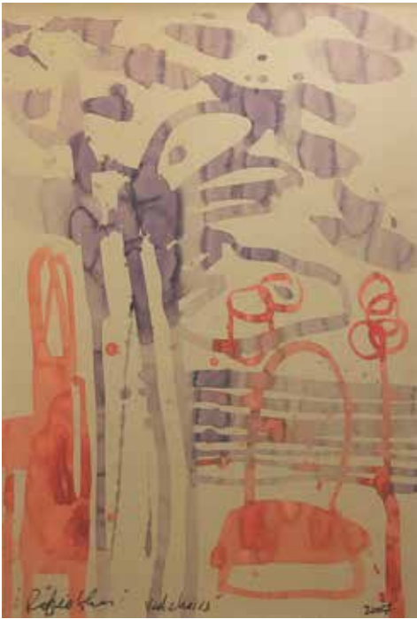
Rafiee Ghani Red Chairs, 2007 Mixed media on paper, 91 x 61.5 cm RM 1,500 - 3,500