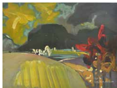
Raphael Scott Ahbeng Lake Joot, Sarawak, 2005 Oil on board, 30 x 45 cm RM 1,000 - 2,500