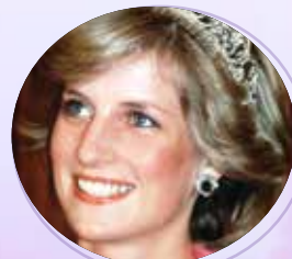
Diana, Princess of Wales