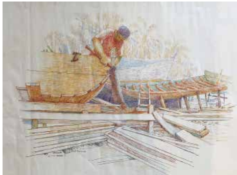
Khalil Ibrahim Boat Builder, 1985 Watercolour on paper, 38 x 50 cm RM 4,000 - 7,000

The late artist was a master storyteller, telling tales of his home in the East Coast as well as its landscapes through his artworks. Entitled, 'Pahang River Landscape, 1950's', this work is no exception, giving the audience a glimpse of beauty through his eyes. Khalil and his affinity for detail and colours are on full display here, capturing the flora surrounding the river, traditional Malay wooden houses, a mountain range in the distance and sampan docked at the river bank. The 1950's was when Khalil produced bounteous landscape works including the "Pahang Series", "Landscape Series" and "Sunset". Khalil's landscapes were his Eden and it can be observed that he was not concerned with any specific object or subject in his vast landscape which was how he liked it and wanted to depict.