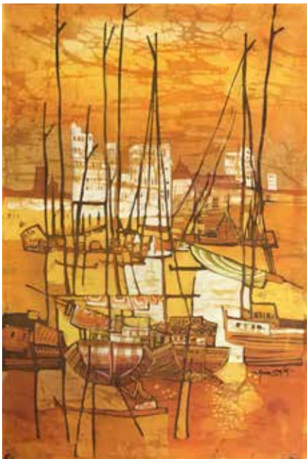
Tan Thean Song Boats, 1980's Batik, 75 x 49.5 cm RM 2,500 - 5,000

Tan Thean Song works mainly in the batik medium, although he also paints in watercolours and Chinese ink. This 1980's work has a boisterous and vibrant orange hue, with the typical cracking-line technique peaking through. It depicts a marina of some kind with wooden boats docked close to each other, while some boats being used. At the background, whitewashed buildings are seen through the lines of the sailboats.