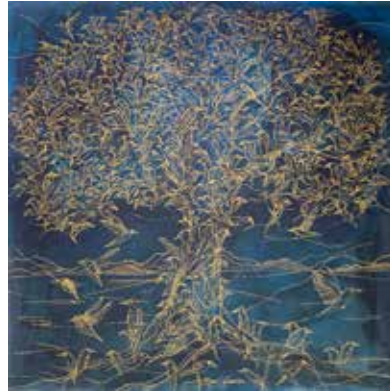
Mohd Khairul Izham Singgah Sana Emas, Paper Series, (Blue), 2022 Acrylic on canvas, 60 x 60 cm RM 2,200 - 4,500