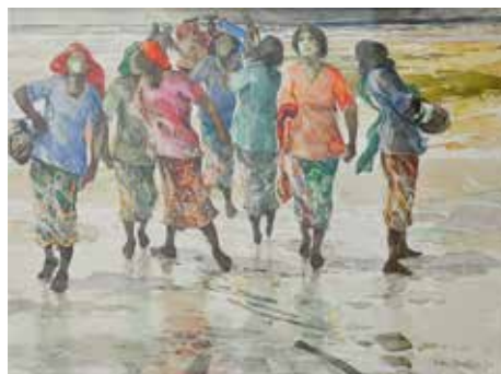
Khalil Ibrahim East Coast Series, 1992 Watercolour on paper, 37 x 27 cm RM 3,000 - 7,000