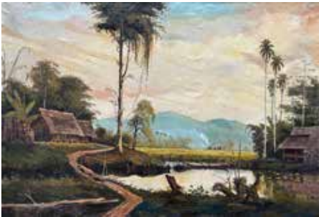
Khalil Ibrahim Pahang River Landscape, 1950's Oil on canvas laid on board, 33 x 49 cm RM20,000 - 45,000

Although most viewers consider this to be a very methodical, planned, and disciplined piece of work with complex, exact lines for design, Nizar Kamal Ariffin's works have a greater and deeper meaning to them. The lines represent spirituality, liberty, faith, and personal development, and as can be seen, they are all interconnected and woven into the fabric of the universe (the canvas). Other times, it might stand for the authoritative figure in charge of overseeing a region or a nation. The brighter area in this piece represents balance in life, and the context suggests that we need faith in order to achieve that equilibrium.