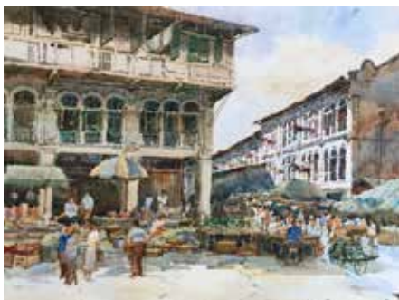
Tong Chin Sye Temple Street , Chinatown, 26.12.1982 Watercolour on paper, 70 x 90 cm RM 15,000 - 28,000