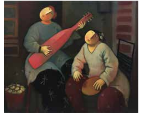
Eng Tay Contemplation I, 1990's Oil on canvas, 51 x 61 cm RM 24,000 - 38,000