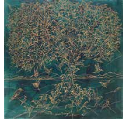
Mohd Khairul Izham Singgah Sana Emas, Paper Series, (Green), 2022 Acrylic on canvas, 60 x 60 cm RM 2,200 - 4,500