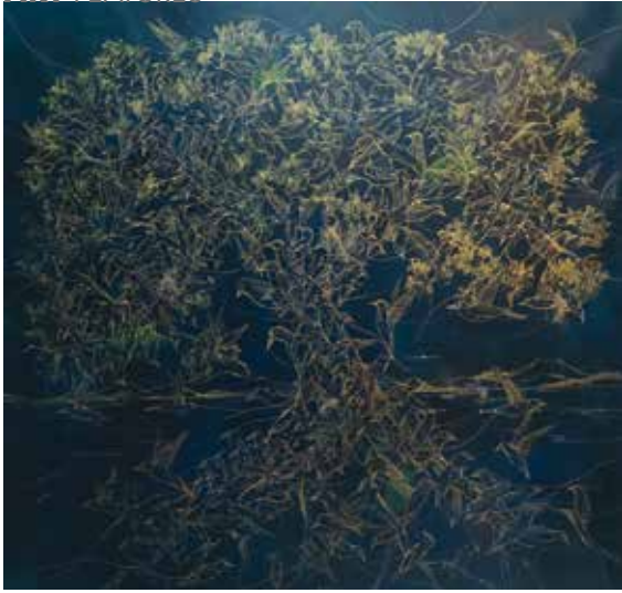
Mohd Khairul Izham Singgah Sana Emas (Blue), 2021 Acrylic on canvas, 152 x 152 cm RM 5,500 - 9,000