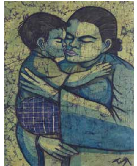
Chuah Thean Teng, Dato' Mother and Child Batik, 55 x 43.8 cm RM 35,000 - 70,000

Dato' Chuah Thean Teng, known as the Father of Batik Art, was a master storyteller. His paintings offered not only a glimpse of the olden days, but also expressed the cultural identity of Malaysians. Complex batik making methods using wax and dyes allowed Teng to create hues that captured the serenity of village life in this radiant composition of the local landscape. This batik work is evident of Teng's proclivity for illustrating scenes and antics such as durian harvesting and villagers carrying the bounty in a basket, on their head.