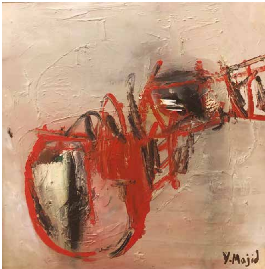
Abstract, 2002 Oil on canvas 43.5 x 43.5 cm