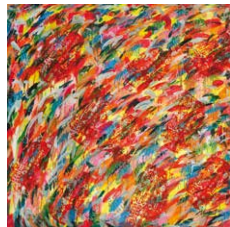
Putaran Kehidupan Alam, 2017 Mixed media on canvas 131 x 131 cm