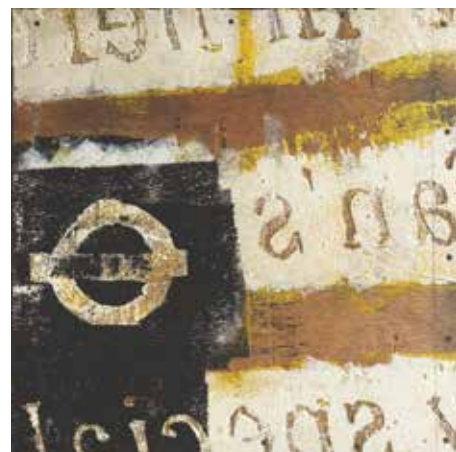
Untitled, 2012 Mixed media on woodcut 32 x 32 cm