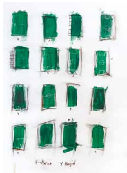
Fixtures - Football Series, 1990's Mixed media on paper 76 x 55 cm