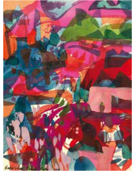
Kabuk Algeria, 2016 Watercolour on Paper 57.5cm x 76 cm