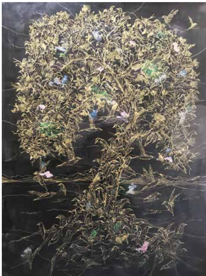
"Singgah Sana Emas" Paper Series, 2021 Acrylic on paper 86 x 62 cm