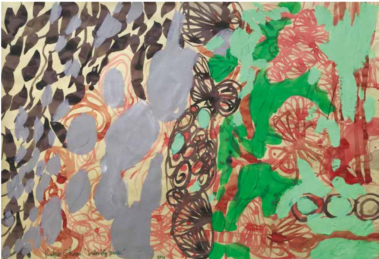
Butterfly Park, 2010 Mixed media on paper 90 x 61.5 cm