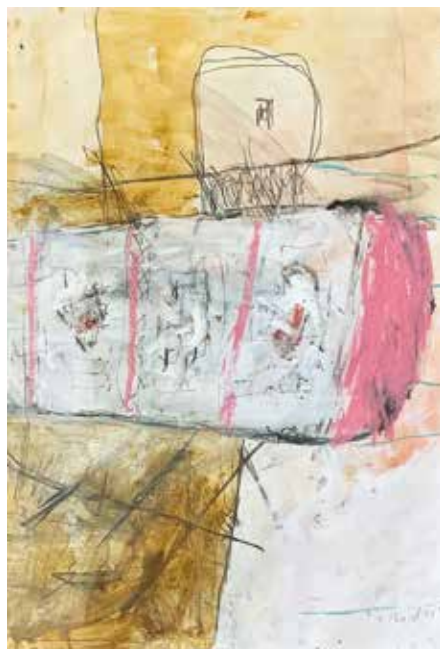
Untitled, 1993 Mixed media on paper 42 x 28.5 cm

Yusof Majid is a product of a Malay-British parentage and hails from a well-to-do family, complete with a comprehensive art education from the illustrious Chelsea School of Art in London with a mantle of an abstract painter to his name. He had defined his style in paintings with geometric and block-like forms that erred to the side of minimalism. Colours were laid on flat, narrative discarded, and Clement Greenberg's assertion of the "ineluctable flatness" of Modern Painting was an apt description. Recognizing the difficulty of connecting with audiences on abstract grounds, Yusof Majid made the turnaround towards figurative works. For Yusof Majid, the transition began with The Young Steam Train (2004), a work that utilised the enduring theme of childhood and borrowed memories from his own (a childhood fondness for trains).