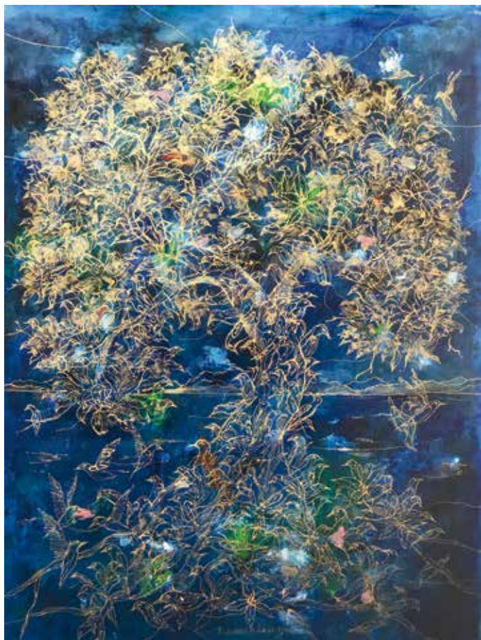
"Singgah Sana Emas" Paper Series, 2021 Acrylic on paper 86 x 62 cm