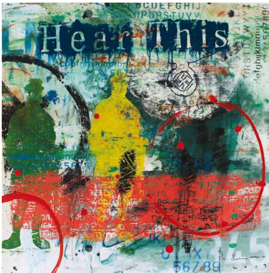
Before the War, 2010 Oil on linen 74 x 74 cm