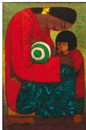
Chuah Thean Teng, Dato B. China, 1914 - 2008 Mother and Children, 1990's Batik 92 x 61 cm SOLD RM 128,800 KLAS Art Auction 8 November 2020