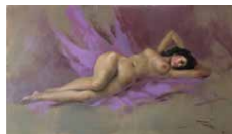
Raden Baseki Abdullah Central Java, 1915 Nude Oil on canvas 65 x 120 cm SOLD RM 128,800 KLAS Art Auction 1 March 2020