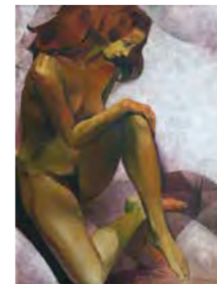
Cesar Legaspi B. Philippines, 1917 - 1994 Nude, 1978 Oil on wood 65 x 50 cm SOLD RM 71,680 KLAS Art Auction 12 July 2020