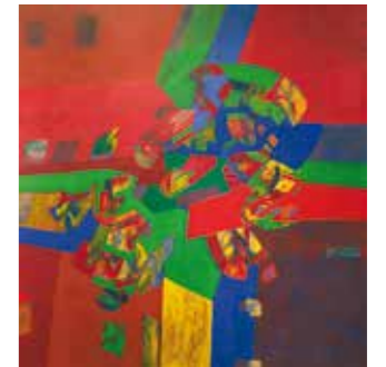
Sharifah Fatimah Syed Zubir, Dato B. Kedah, 1958 Song of Songs 2, 1998 Acrylic on canvas 136 x 120 cm SOLD RM 64,960 KLAS Art Auction 1 March 2020