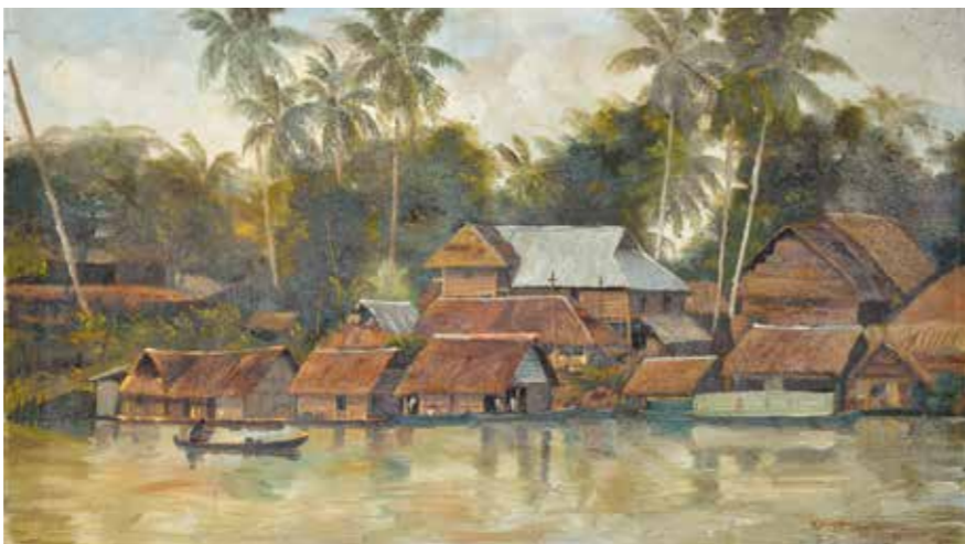
Pahang River Boathouses, 1957 Oil on canvas 35 x 61 cm