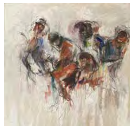
Yusof Ghani B. Johor, 1950 Siri Tari 14/91, 1991 Oil on canvas 122 x 122 cm SOLD RM 120,960 KLAS Art Auction 6 September 2020