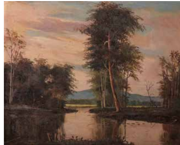
Sunrise (Pahang River Series), 1950's Oil on board 34 x 46cm