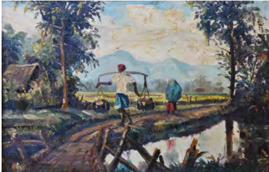
Sawah Padi Series, 1956 Oil on Board 30cm x 45.5cm