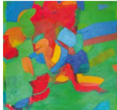
Sharifah Fatimah Syed Zubir, Dato B. Kedah, 1958 Greenscape, 1987 Acrylic on canvas 102 x 106 cm SOLD RM 44,800 KLAS Art Auction 6 September 2020