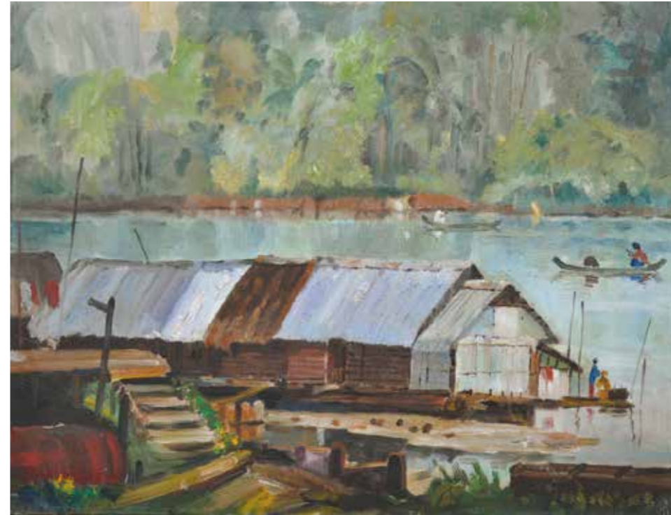
Kota Bharu Boathouses (Rumah Rakit Kota Bharu), 1960 Oil on canvas 40.5cm x 61cm