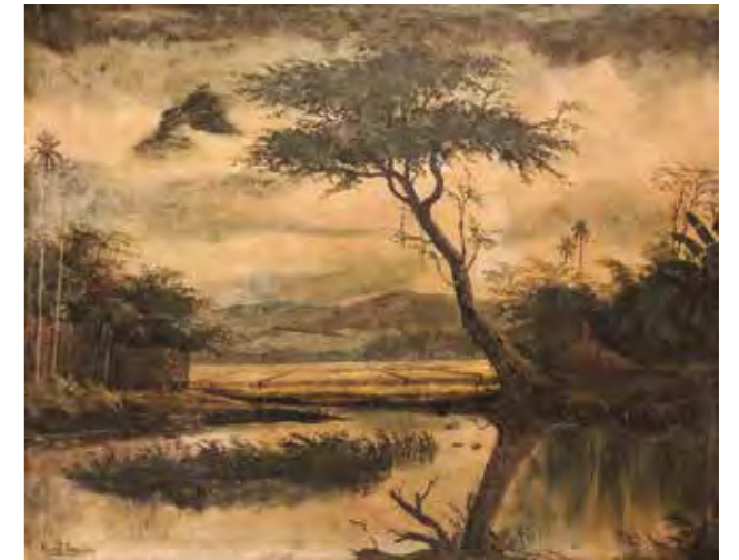
Sunset (Pahang River Series), 1950's Oil on board 35 x 45cm