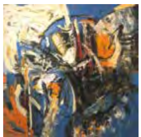
Awang Damit Ahmad B. Sabah, 1956 Payarama Baru "Ikon Semudra...Bangau", 2016 Mixed media on canvas 122 x 122 cm SOLD RM 45,920 KLAS Art Auction 6 September 2020