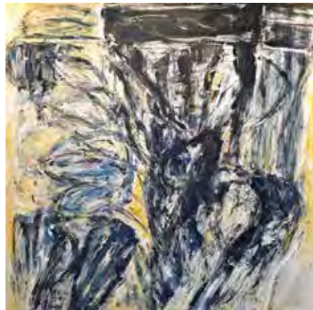
Abdul Latiff Mohidin Dark Bakau, 1999 Oil on canvas 122 x 122 cm SOLD RM 240,800 KLAS Art Auction 1 March 2020