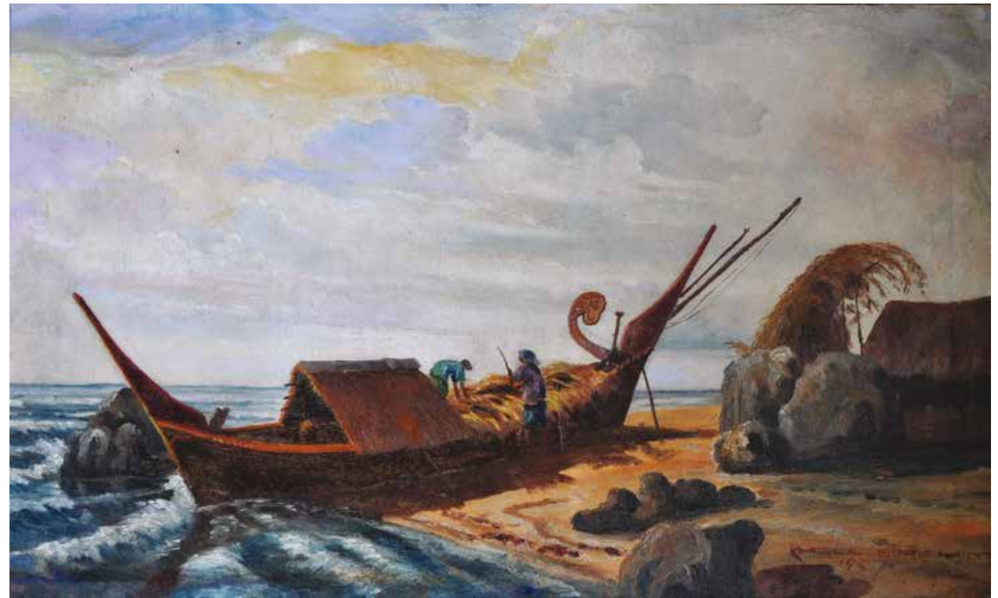
Bachok, 1957 Oil on canvas 32 cm X 52 cm

With Khalil Ibrahim's legendary status and sheer talent, his works across all mediums are highly valued till today. More importantly, his landscape works of the 1950's are beauty captured on canvas and a rarity. Only a limited number of artworks were produced by the artist and remains highly coveted by art collectors and institutions alike.