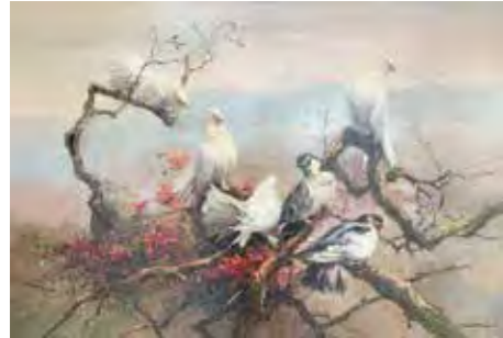
Choo Keng Kwang B. Singapore, 1931 Pigeons, 1983 Oil on board 76 x 120 cm SOLD RM 57,120 KLAS Art Auction 1 March 2020