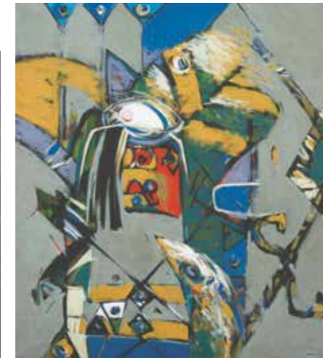
Awang Damit Ahmad B. Sabah, 1956 EOC Series "Sinumandak", 1988 Acrylic on canvas 89 x 79 cm SOLD RM 79,520 KLAS Art Auction 8 November 2020