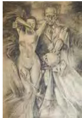
Lee Man Fong B. China, 1913 – 1988 "Goddess of Life & Death I" (Amsterdam), 1952 Charcoal on paper 71 x 48 cm SOLD RM 56,000 KLAS Art Auction 1 March 2020