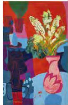
Rafiee Ghani B. Kedah, 1962 Still Life, 1994 Acrylic on canvas 154 x 96 cm SOLD RM 44,800 KLAS Art Auction 6 September 2020