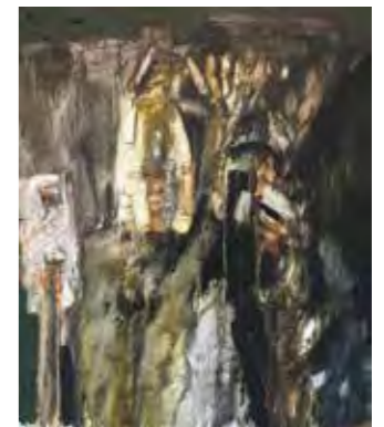
Awang Damit Ahmad B. Sabah, 1956 Marista Sisa Semusim IV, 1996 Mixed media on canvas 135 x 120 cm SOLD RM 57,120 KLAS Art Auction 6 September 2020