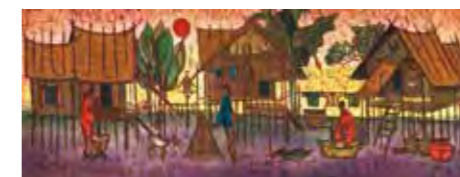
Chuah Thean Teng, Dato B. China, 1914 - 2008 Village Scene Batik 45 X 119 cm SOLD RM 64,960 KLAS Art Auction 6 September 2020