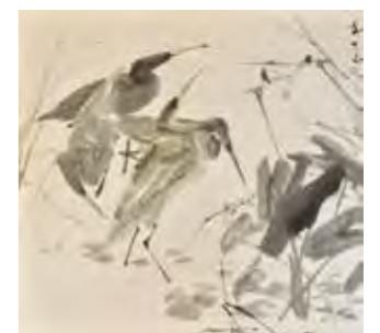
Chen Wen Hsi B. China, 1906 - 1991 Herons Ink on paper 65 x 68 cm SOLD RM 61,600 KLAS Art Auction 1 March 2020