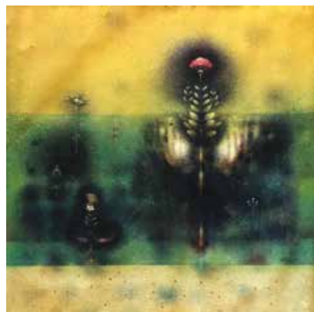
Suhas Roy B. India, 1936 – 2016 Landscape with Flowers and Bird, 1971 Mixed media on canvas 99 x 99 cm SOLD RM 52,640 KLAS Art Auction 1 March 2020