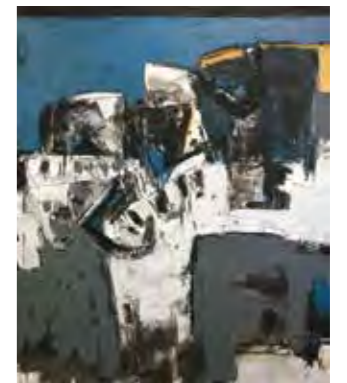
Awang Damit Ahmad B. Sabah, 1956 Iraga "Memori Kelabu" 2004 Mixed media on canvas 148 x 122 cm SOLD RM 66,080 KLAS Art Auction 12 July 2020