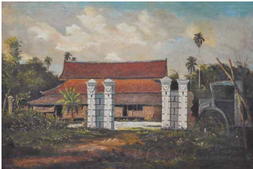
Grand Palace of Kota Bharu (Kampung Home of Tengku Razaleigh Hamzah) - Kota Bharu (5.12.1956) Oil on canvas 34cm x 50cm