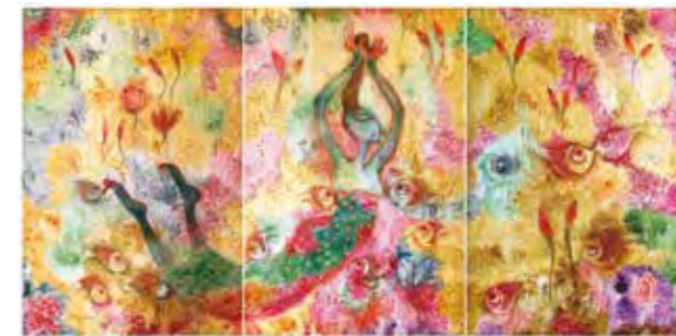
Syed Thajudeen B. India, 1943 Lightness of Being, 1999 Oil on canvas 136.5 x 273 cm (Triptych) SOLD RM 84,000 KLAS Art Auction 12 July 2020