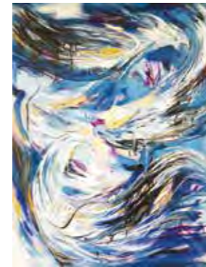
Yusof Ghani B. Johor, 1950 Biring Series XIV, 2006 Oil on canvas 122 x 90 cm SOLD RM 103,040 KLAS Art Auction 7 July 2020