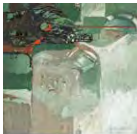
Ibrahim Hussein, Datuk B. Kedah, 1936-2009 Freeze, 1964 Gouache on printed magazine paper laid to card 21.5 x 21.5 cm SOLD RM 47,040 KLAS Art Auction 1 March 2020