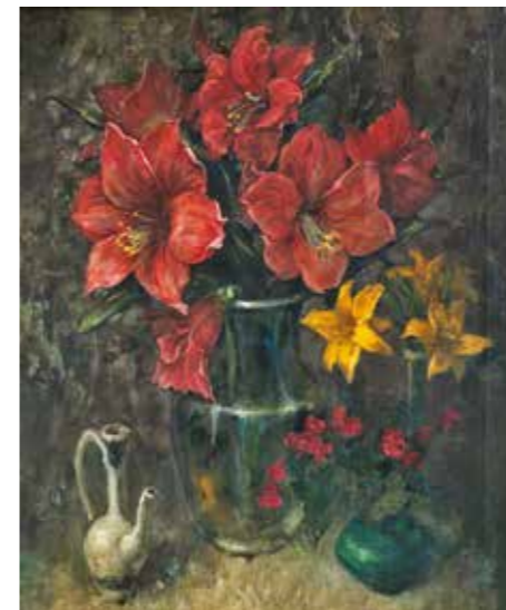
Lee Man Fong B. China, 1913 - 1988 Still Life Flowers, 1940s Oil on canvas 74 x 61 cm SOLD RM 95,200 KLAS Art Auction 1 March 2020