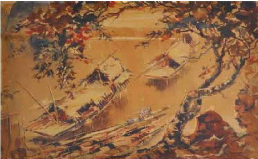
Abdullah Ariff Destination, 1950 Watercolour on paper 34.5 x 52.5 cm SOLD - RM 55,000