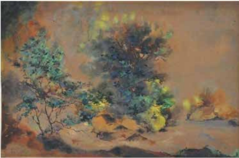
Abdullah Ariff Misty, 1954 Watercolour on paper 34.5 x 52.5 cm SOLD - RM 44,000