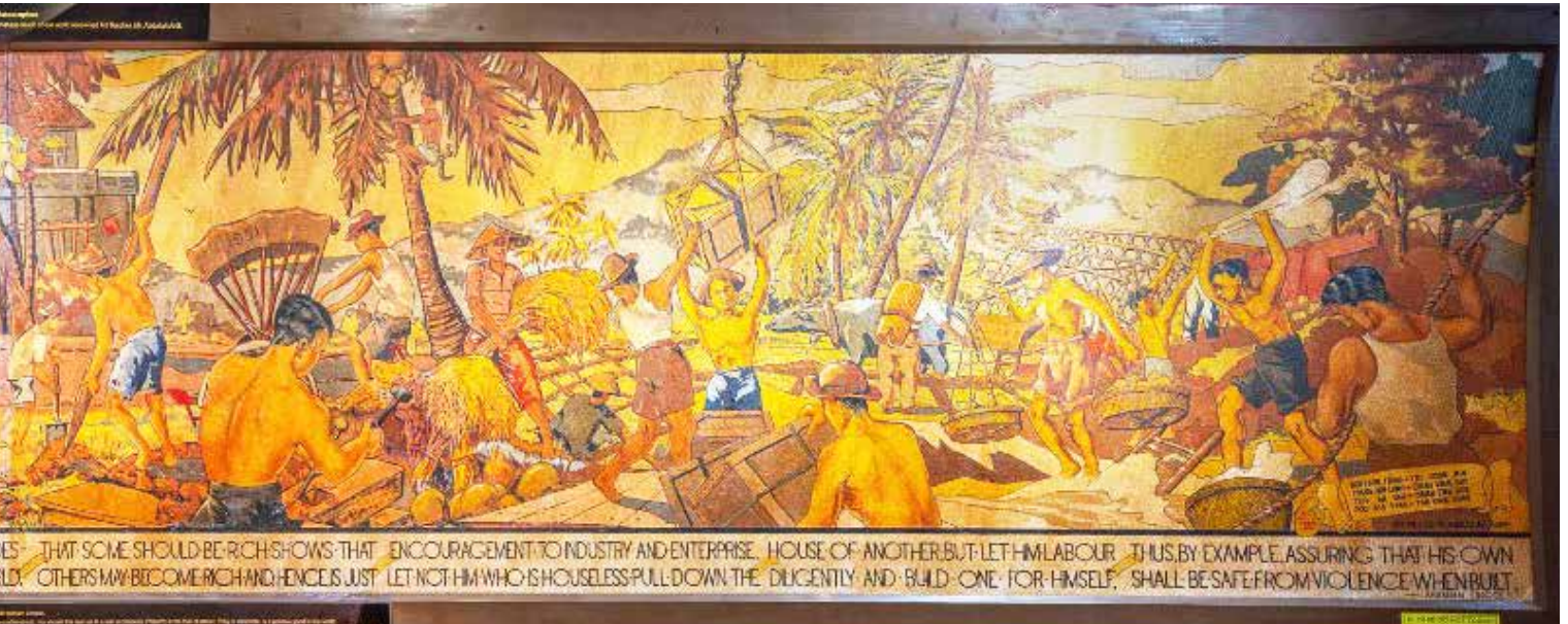
This mural depicts the country's traditional professions during that era and aims to instill diversity in the current MBS students. Today, the mural hangs in the school's Heritage Centre and can be viewed by appointment.