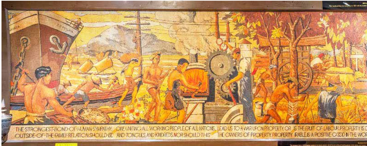
This watercolour on soft board mural was painted in 1951 by the students of the Art Club at Methodist Boys School (MBS). The mural spans up to 7.3 metres long and was conceptualised, sketched and supervised by Malaysia's pioneer artist, Abdullah Ariff.