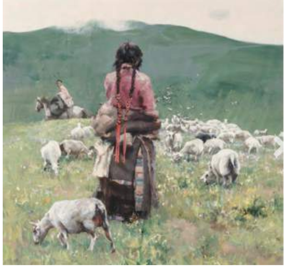
Yang Ke Shan (Chinese, b. 1947) Girl with Sheep, 1987 Tempera on board. 26-1_2 x 25-1_2 inches (67.5 x 64.8 cm)

istory is not only written by people, but often times also painted by people. Numerous painting masters have emerged from China, some keeping to traditional Chinese painting while other artists chose to question, rebel and revolutionise the modern and contemporary art in China. In this feature, KL Lifestyle Art Space (KLAS) highlights five Chinese artists and their artworks.