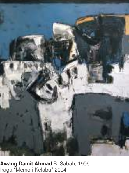
Mixed media on canvas 148 x 122 cm RM 66.080

"Fishing Village Road in Kuala Besar, Tumpat, Kelantan", had a starting price of RM 4,000 but was sold to a lucky bidder at RM11, 200.