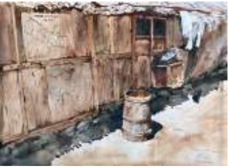
Ong Kim Seng B. Singapore, 1945 Darapani Find - Nepal Series, 1980 Ink and colour on paper 73.5 x 53 cm RM 28.000