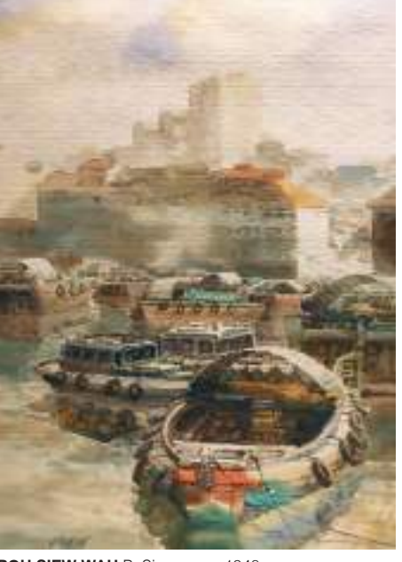
POH SIEW WAH B. Singapore, 1948 Singapore River, 1980's Watercolour on paper 54 x 37 cm RM 3,472