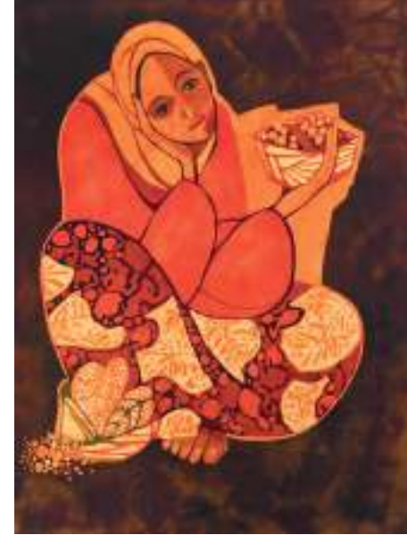
Seah Kim Joo B. Singapore, 1939 Seated Woman, 1970's Batik 60 x 45 cm RM 8,960