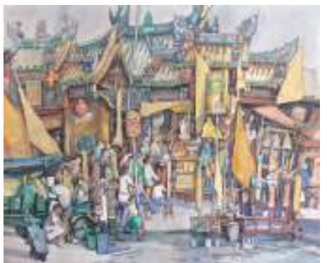
Tay Mo Leong, Dato B. Penang, 1938 Goddess of Mercy Temple - Georgetown Penang, 1970's Watercolour on paper 57 x 75 cm RM 13, 440