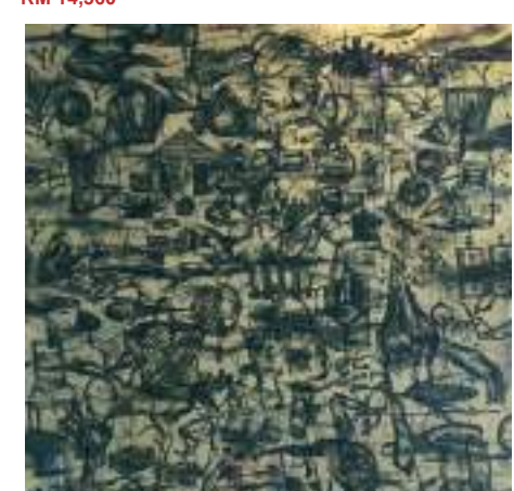
MOHD KHAIRUL IZHAM B. Pahang, 1985 Di Ketika dan Waktu, 2015 Acrylic on canvas 197 x 152 cm RM 7,280