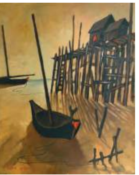
TAY BOON PIN B. Singapore, 1936 Untitled, 1972 Acrylic on canvas 35.5 x 28 cm RM 3,660