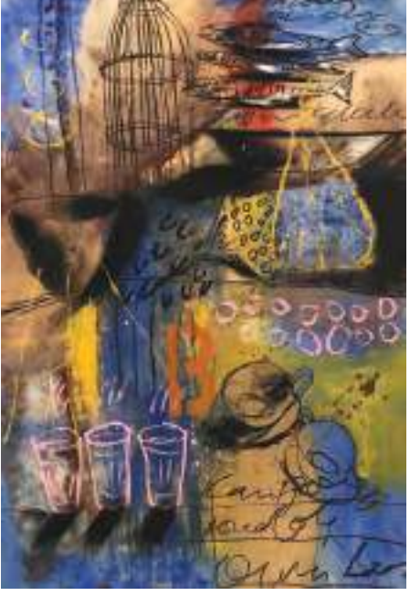
Jailani Abu Hassan B. Selangor, 1963 Ikan Kekek, Kampong Pondok, 2005 Mixed media on paper 111 x 76 cm RM 17 920