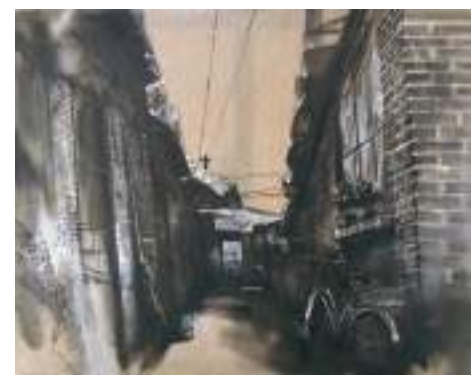
Lu Hao (Chinese, b. 1969) VANISHING HOME SERIES 2006 Acrylic on linen 80.0 x 99.7 cm

Lu Hao's artworks tightly associate with the transformations and developments of Chinese cities. His works embody the celebration, satire and mockery of such metamorphosis using plexialass as the primary material in his installation works. This specific material is often used in the construction of buildings, furniture and some large format building tools - an association to city developments. The artist has participated in numerous biennales all over the world such as the Venice Biennale, Sao Paolo Biennale, Shanghai Biennale, Lyon Biennale and Istanbul Biennale.