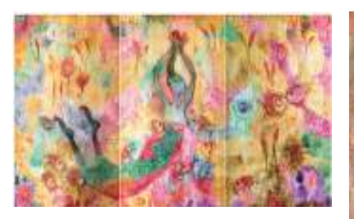
Syed Thajudeen B. India, 1943 Lightness of Being, 1999 Oil on canvas 136.5 x 273 cm (Triptych) RM 84,000