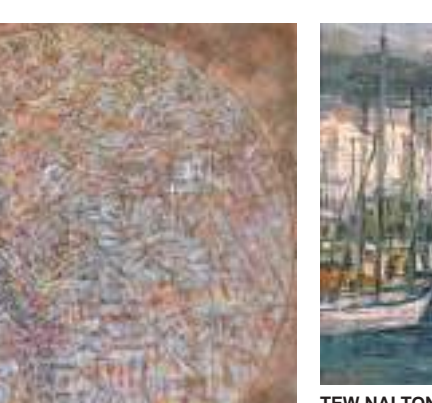
Nizar Kamal Ariffin B.Pahang, 1964 Sejambak Aman #5, 2017 Acrylic on canvas 122 x 122 cm RM 14,560