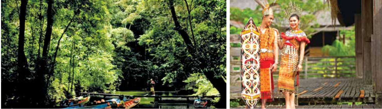
Gunung Mulu National Park