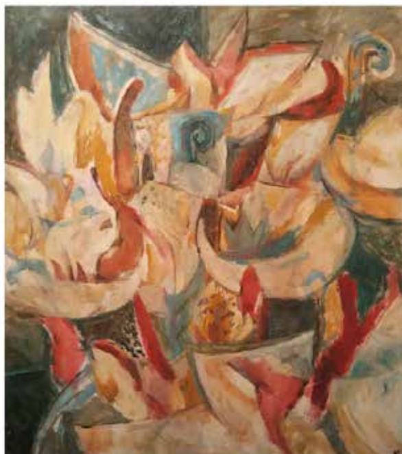
Abdul Latiff Mohidin Pago-Pago Series, 1963 Oil on canvas 87 x 75 cm (Formerly in the Private Collection of Datuk Syed Ahmad Jamal)

SPECIAL PREVIEW RECEPTION SATURDAY 14 MAY 2016 | 3.00 PM - 7.00 PM