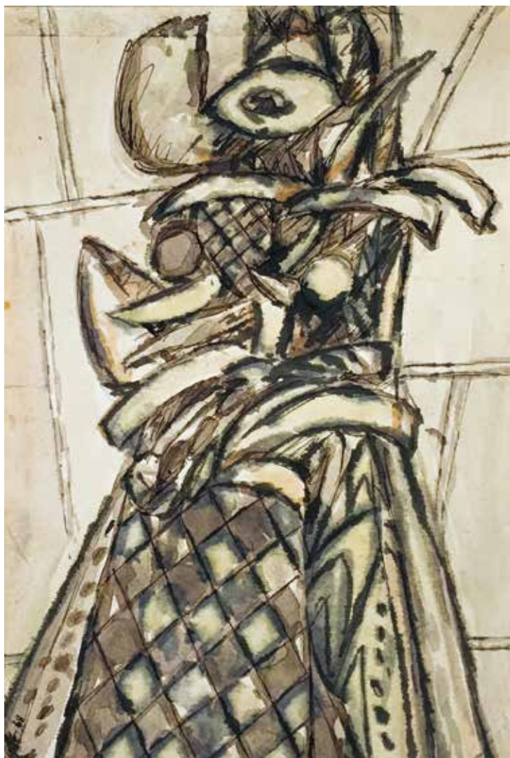
Abdul Latiff Mohidin "Kelantanese Harlequin" Watercolour on Paper 16.5cm x 25cm, a rare masterpiece which was previously used for the cover of an exhibition at the National Art Gallery.