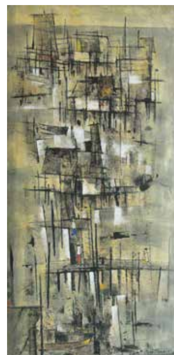
EDITION XI, SEPTEMBER 28, 2014 Fishing Village - Johore, 1961 Ink and colour on paper 91 x 45 cm SOLD - RM 190,400.00