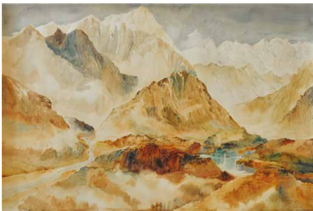
EDITION XI, SEPTEMBER 28, 2014 Himalayan Panorama, 1982 Watercolour on paper 77.5 x 113 cm SOLD - RM 56,000.00