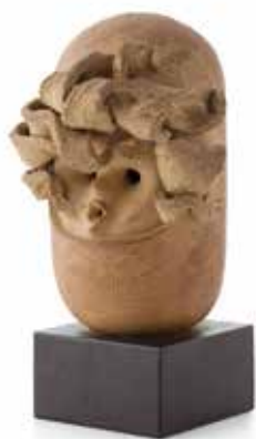
EDITION XI, SEPTEMBER 28, 2014 Pottery Head, Undated Stoneware 22 x 9 x 9 cm SOLD - RM 13,440.00