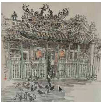
EDITION XI, SEPTEMBER 28, 2014 Thian Hock Keng Temple, Circa 1970s Brush and ink with watercolour on paper 67 x 66.5 cm SOLD - RM 84,000.00