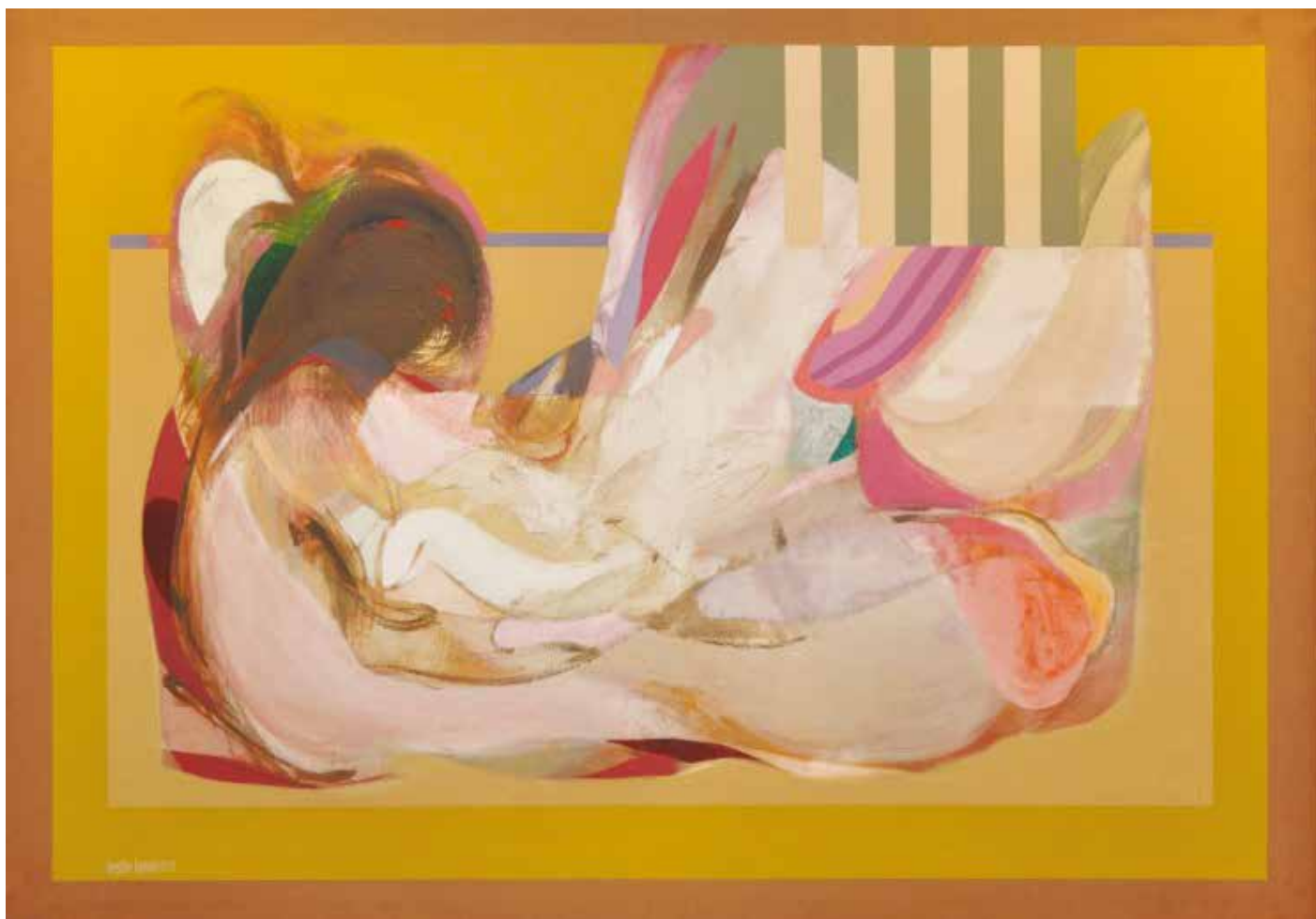
EDITION III, APRIL 7, 2013 Now and Again It Flowers - Series I, 1973 Acrylic on canvas 129 x 183 cm SOLD - RM 781,000.00