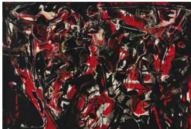
EDITION XXII, SEPTEMBER 4, 2016 Siri Tari XII, 1989 Mixed media on canvas 117 x 165 cm SOLD - RM 225,440.00