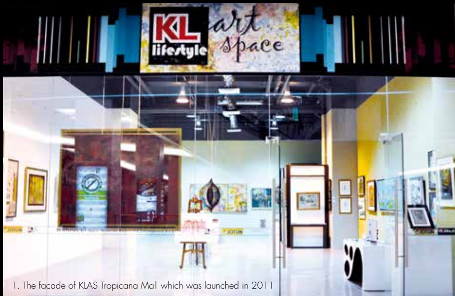
1. The facade of KLAS Tropicana Mall which was launched in 2011