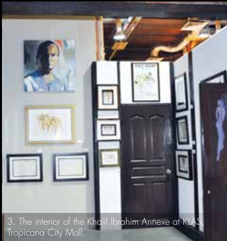
3. The interior of the Khalil Ibrahim Annexe at KLAS, Tropicana City Mall.