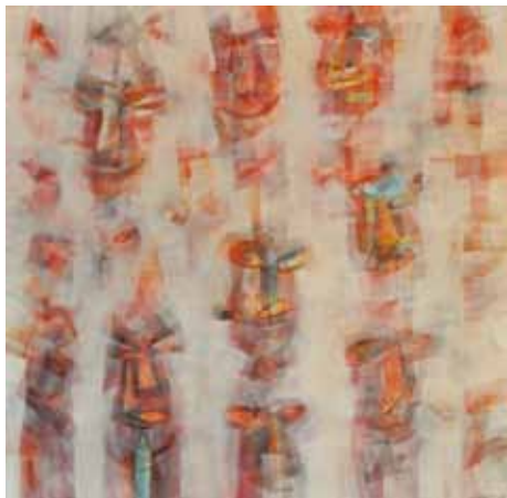
Mascara Series, 2003 82 x 82 cm Acrylic on Canvas

His passion for painting was first provoked by his relentless soul-searching journey which is depicted through his artworks of inner beauty of time, space and mass.