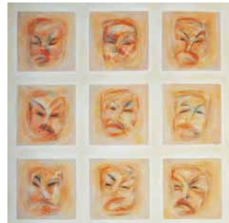
Mascara, 1999 82 x 82 cm Oil on Canvas

He graduated in Fine Arts and Graphics from Universiti Sains Malaysia, Nizar and had experience freelancing in graphic and paint works before moving to Kuala Lumpur in 1993 where he painted at APS (Angkatan Pelukis SelMalaysia), Central Market. He eventually became a full-time painter at the Conlay Artist Colony, Malaysia Craft Complex in 1998.