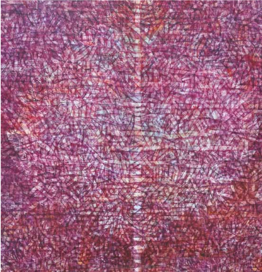
Siri Pohon Beringin - Daerah # 15