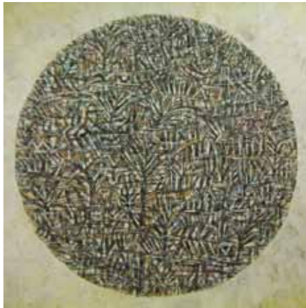
Faces and Faces - Siri Dunia Al Wahid, 2010 127 x 127 cm Oil on Canvas