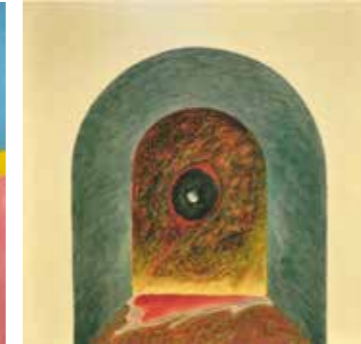
ABDUL LATIFF MOHIDIN Mindscape Series - Mindscape - 27, 1983 Oil on canvas 89.5 x 90 cm SOLD RM 336,000