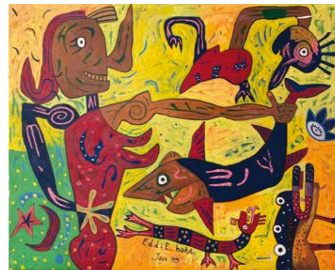
Eddie Hara Java, 1995 Acrylic on canvas 71 x 90 cm RM 7,000 - RM 10,000

The enigmatic Eddie Hara was born in 1957, in Salatiga, Central Java, Indonesia. Eddie, one of Indonesia's most prolific artists has single-handedly contributed to the birth of a new genre through a display of distinct visual language, heavily generated by the wildness and innocence of raw art. He pursued an education in art at the Indonesian Institute of Arts (ISI) Yogyakarta, Indonesia, followed by Akademie voor Beeldende Kunst Enschede (AKI) in the Netherlands.