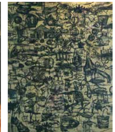
MOHD KHAIRUL IZHAM Di Ketika dan Waktu, 2015 Acrylic on canvas 197 x 152 cm SOLD RM 11,200