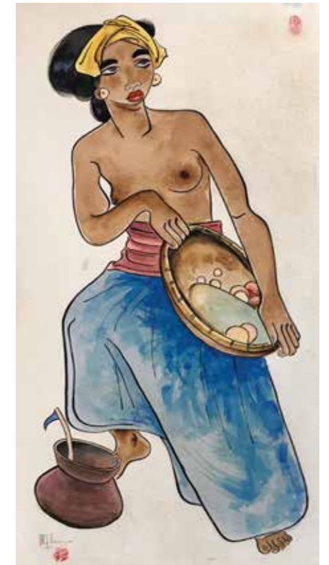
Lee Man Fong Untitled - Amsterdam, Circa 1948 Oil on paper laid on masonite board 71.5 x 38.5 cm