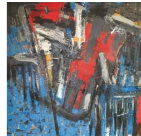
AWANG DAMIT AHMAD Payarama Series - Payarama Baru "Kabat dan Takiding", 2016 Mixed media on canvas 122 x 122 cm SOLD RM 49,280