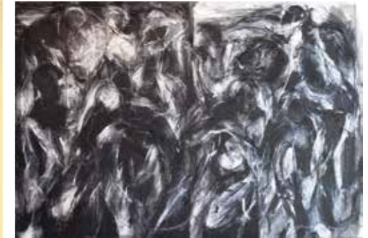
YUSOF GHANI Siri Tari XVII, 1990 Oil on canvas 120 x 176 cm SOLD RM 165,760