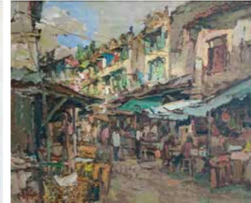
TAN CHOH TEE Singapore Street Scene, 1985 Acrylic on canvas 53 x 64 cm SOLD RM 63,840