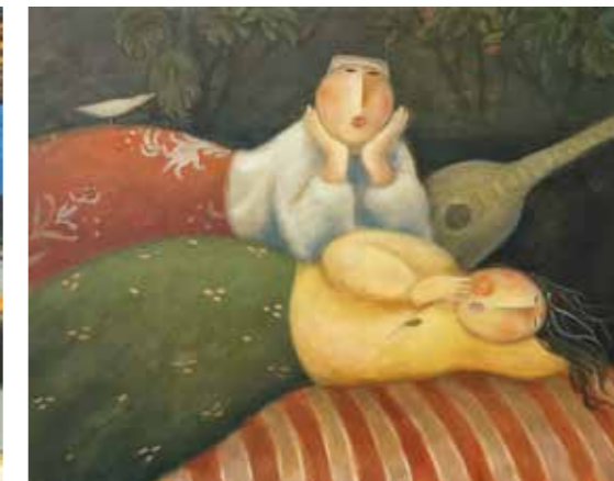
ENG TAY Lovers II, 1993 Oil on canvas 60.5 x 76 cm SOLD RM 28,000