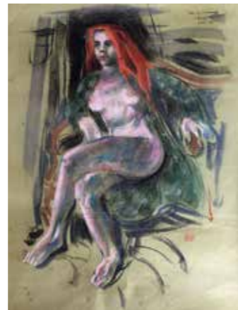
Lee Man Fong Nude Sketch, Amsterdam, 1948 Pastel on paper 63 x 48 cm RM 25,000 - RM 35,000

At that point, Lee became the first non-Dutch artist to be invited to provide works for an exhibition organised by the Dutch East Indies Association. During this time, he was introduced to the techniques