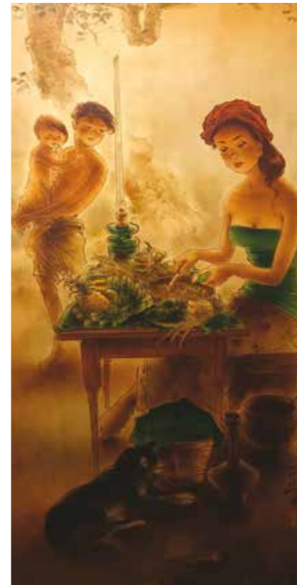
Lee Man Fong Rojak Seller Oil on board 103 x 51 cm RM 200,000 - RM 350,000

Lee continued to exhibit within Indonesia and was heralded as a major artist of the period. His final solo exhibition at the National Gallery in Singapore was a major success, and he donated its proceeds to the National Kidney Foundation. Lee died in Jakarta on April 3, 1988 at the age of 75.