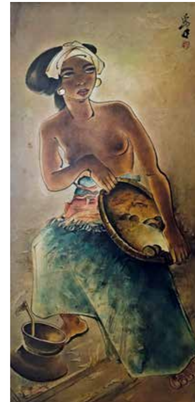
Lee Man Fong Untitled - Amsterdam, Circa 1948 Oil On masonite board 87 x 41.5 cm