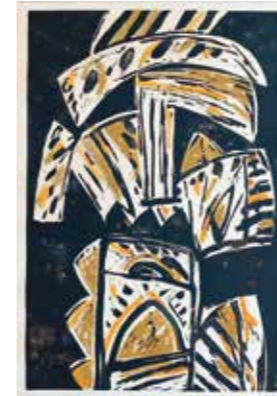
ABDUL LATIFF MOHIDIN Pago Pago Series - Rumbia (Singapore), 1968 Linocut on paper 45.5 x 30 cm SOLD RM 73,920