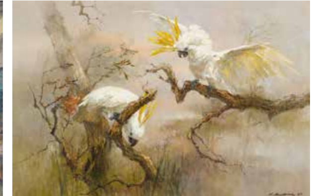
CHOO KENG KWANG Cockatoos, 1983 Oil on board 60 x 89.5 cm SOLD RM 40,320