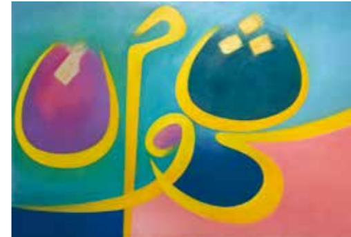
SYED AHMAD JAMAL, DATUK Senyuman, 2009 Acrylic on canvas 122 x 183 cm SOLD RM 392,000