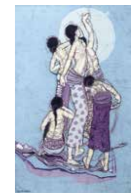
East Coast Series, 1973 Batik, 90 x 60 cm SOLD RM 132,000 KLAS Art Auction 19 January 2014 Sale VII

Khalil Ibrahim graduated from the prestigious St. Martin's School of Art & Design, United Kingdom in 1964. The 'East Coast Ladies', 1970s is yet another masterpiece that renders aficionados in awe. This work immediately oozes a simple charm and one can't help but smile looking at it. A muted background is used here to shed light on the Malay women. In a typical Khalil manner, the artist granted his subjects fluid motion, signifying the femininity and grace of women. The vibrant gold palette, depth and feeling it possesses allows spectators to see through Khalil's eyes, transporting them to simpler times in the East Coast where the ladies were clad in kebaya and sarongs, tending to their daily chores. Khalil's paintings and his prodigious batik works are unfailing in hitting outstanding prices – this is evident with 'Abstract, 1996', in KLAS Art Auction Sale VII, January 2014 which sold for RM132,000.