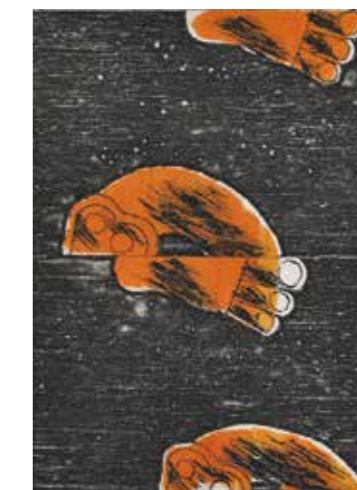
Abdul Latiff Mohidin, B. Negeri Sembilan, 1941 Rumbia 1968 Edition 1/3 Linocut on paper 45.5 x 30 cm RM50,000 – RM90,000