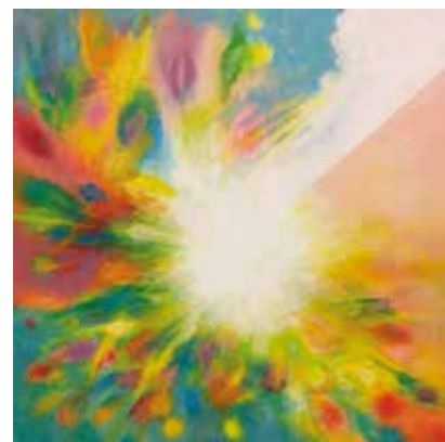
Nur Tenaga, 2010 Acrylic on canvas 153 x 152 cm SOLD RM 490,332.00 Klas Art Auction 30 July 2017 Sale XXVIII

Among the artworks to look out for during the KLAS Art Auction Sale XXXVII is one of Malaysia's prominent artists, Datuk Syed Ahmad Jamal's 'Senyuman' (smile). This beautiful piece of work is a confluence of modernity and culture, exhibiting vibrant colours and a subtle grace to command viewers' attention. We currently hold the record hammer price for Datuk Syed Ahmad Jamal's artwork entitled 'Nur Tenaga', hammered in KLAS art auction SALE XXVIII, on July 30, 2017 for a whopping RM490,332.