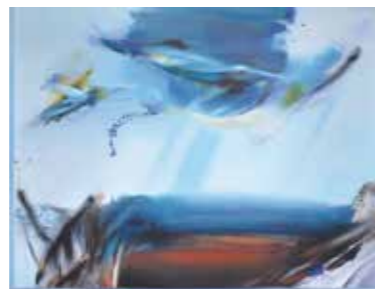
Blue Birds, 2005 Oil and acrylic on canvas 137 x 170 cm SOLD RM 105,956.80 KLAS Art Auction 12 March 2017 Sale XXVI

Concocted by Jolly Koh in 2011, 'Landscape' is a medley of wonderful and harmonious hues, supplemented by different intensities and tones. It possesses an otherworldly atmosphere hallmark of Jolly Koh's works. Inspired by his own mind and skills, his style of painting is purely derived from his fantasy world and he morphs it into a tangible form with the combined use of oil and acrylic. This arresting landscape is an incorporation of nature and his prowess as a romantic and lyrical painter. Jolly Koh's paintings are frequently exhibited in KLAS's art auction – among his highest grossing painting is the 'Blue Birds, 2005' from Sale XXVI, hammered after a bidding war for RM105,956.80.