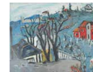
My Days In France, 1959 Oil on canvas 51 x 62 cm SOLD RM 28,600.00 KLAS Art Auction 30 September 2012 Sale I