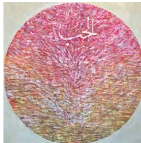
Nizar Kamal Ariffin A Hubbu (Love), 2018 Acrylic on canvas 122 x 122 cm RM15,000 – RM25,000

Bridging realism and abstraction, this artwork by Yusof Ghani sees delicate silhouettes of subjects in their movement and form, converging towards the centre. Lines and sketches on this artwork were executed freely and spontaneously in a liberated and haphazard manner. The subtle splashes of colours give this painting that polished, fluid flair. Yusof Ghani's 'Siri Tari, 1989' exhibited in KLAS Art Auction May 24, 2015 Sale XV saw success when it doubled its upper limit of RM7,000, achieving a hammered price of RM14,160..