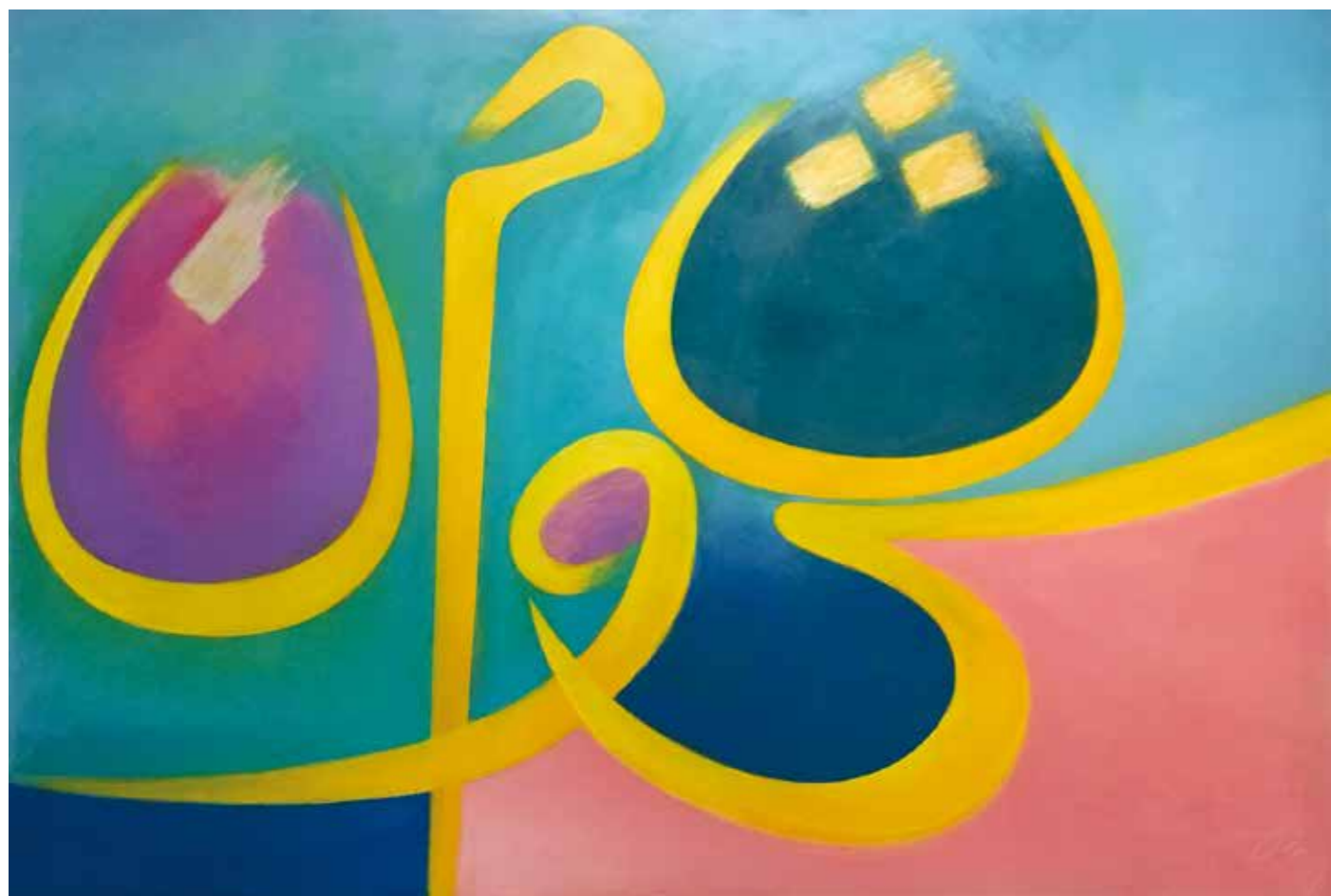
Syed Ahmad Jamal, Datuk, B. Johor, 1929 – 2011 Senyuman 2009 Acrylic on canvas 122 x 183 cm RM420,000 – RM600,000

KL Lifestyle Art Space (KLAS) will host its much-anticipated third modern and contemporary art auction of the 2019 calendar year on Sept 29. KLAS art auction is an event patronised by artists, art collectors, the beau monde and like-minded individuals. The distinguished art auction features an array of masterpieces from Malaysian and Asian art masters from around the region. Since its inception in 2012, KL Lifestyle Art Space has sold over 2,800 artworks. Here, we list the key - artworks to look forward to during the auction, so mark your calendar for an art-filled day.