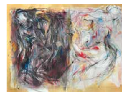
Siri Tari - Drawing/90, 1990 Mixed media on paper 53 x 72.5 cm SOLD RM 33,816.00 KLAS Art Auction 13 November 2016 Sale XXIV

Bridging realism and abstraction, this artwork by Yusof Ghani sees delicate silhouettes of subjects in their movement and form, converging towards the centre. Lines and sketches on this artwork were executed freely and spontaneously in a liberated and haphazard manner. The subtle splashes of colours give this painting that polished, fluid flair. Yusof Ghani's 'Siri Tari, 1989' exhibited in KLAS Art Auction May 24, 2015 Sale XV saw success when it doubled its upper limit of RM7,000, achieving a hammered price of RM14,160..