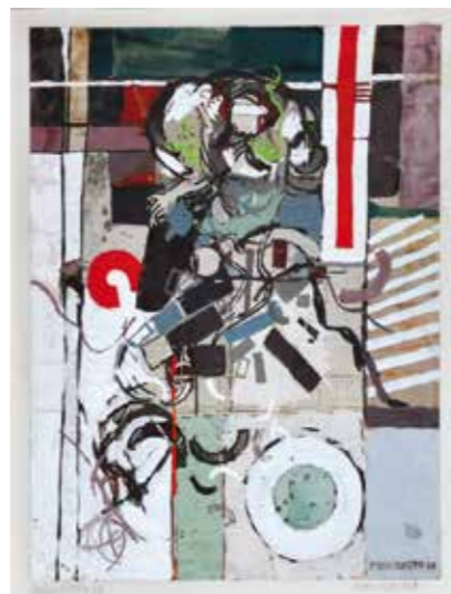
Mother and Child, 1964 Gouache on magazine page 33 x 25 cm SOLD RM 67,632.00 KLAS Art Auction 23 October 2016 Sale XXIII

"In the summer of '64, I took with me a portfolio of 50 gouaches to New York, I put up with a friend, the portrait painter of the former Shah of Iran. I went to the Life and Times Magazine office to see a friend I knew in New York and he introduced me to the Time art critic who gave me the names of art galleries in New York and the address of the Gallerie Internationale in Madison Avenue. Like a school boy with my over-sized portfolio, I went to the Gallerie and demanded to see the art director who wasn't in at the time. I left my paintings there. Three days later, they offered me a one-man exhibition and a contract to work for the Gallerie. A week later, they sent me a cheque for the sale of 10 gouaches. I asked for the return of the rest of the paintings and left for Washington." - stated by Ib in his Retrospective published by the National Art Gallery in 1986.