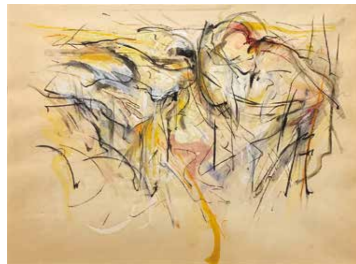
Yusof Ghani B. Johor, 1950 Siri Tari – Drawing /90, 1990 Mixed media on paper 45 x 60 cm RM8,000 – RM15,000