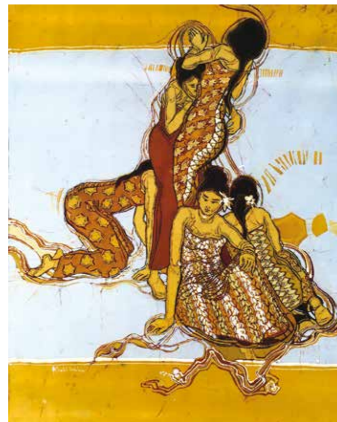
Khalil Ibrahim East Coast Ladies, 1970s Batik 87 x 70 cm RM80,000 – RM 120,000

Khalil Ibrahim graduated from the prestigious St. Martin's School of Art & Design, United Kingdom in 1964. The 'East Coast Ladies', 1970s is yet another masterpiece that renders aficionados in awe. This work immediately oozes a simple charm and one can't help but smile looking at it. A muted background is used here to shed light on the Malay women. In a typical Khalil manner, the artist granted his subjects fluid motion, signifying the femininity and grace of women. The vibrant gold palette, depth and feeling it possesses allows spectators to see through Khalil's eyes, transporting them to simpler times in the East Coast where the ladies were clad in kebaya and sarongs, tending to their daily chores. Khalil's paintings and his prodigious batik works are unfailing in hitting outstanding prices – this is evident with 'Abstract, 1996', in KLAS Art Auction Sale VII, January 2014 which sold for RM132,000.