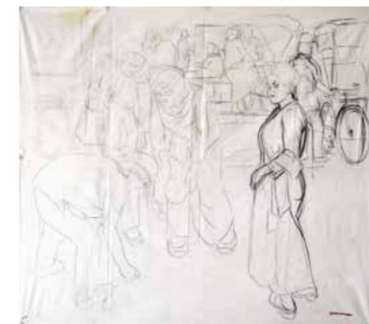
Kota Bharu Market unfinished batik.

Ismail Mat Hussin & Kwan Chin Kota Bharu Market, 2014 Batik 106 x 113 cm RM 8,000 - RM 16,000 KLAS Art Auction 15 April 2018 Sale XXXI