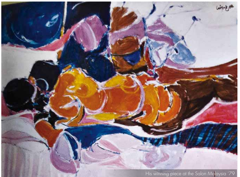
His winning piece at the Salon Malaysia '79