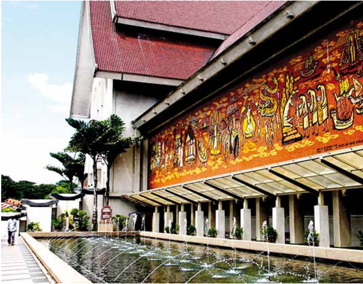
Mural at the Muzium Negara