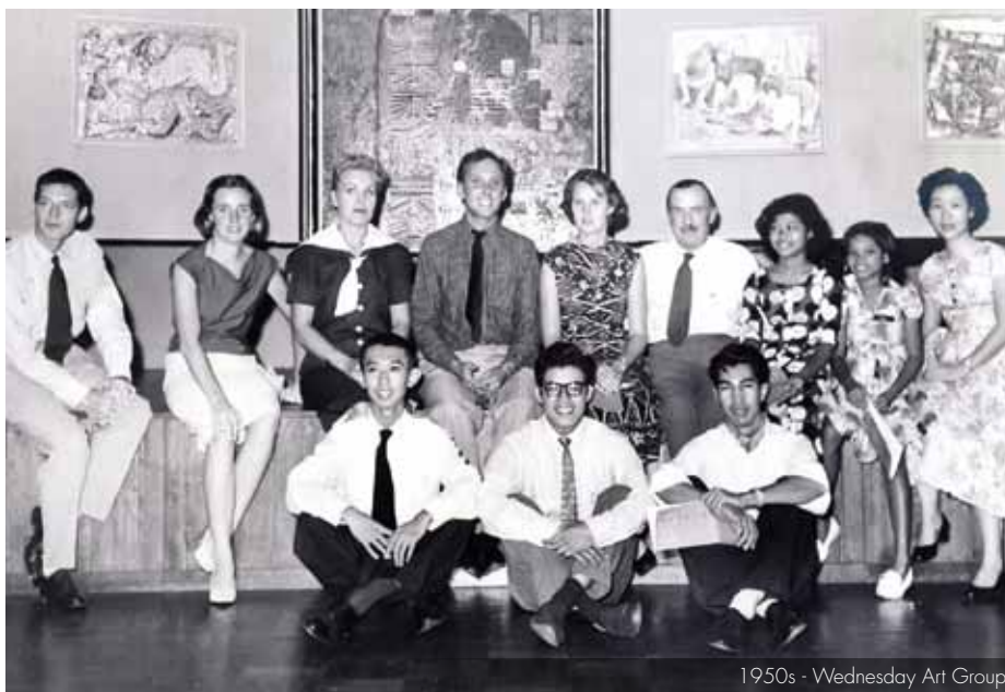
1950s - Wednesday Art Group

“I presume I was born with the ability to draw. I remember when I was a child, whenever I was free I liked to draw on paper or on the wall. But back then I didn’t know what an artist was, because during that era there were not any art school or movement or anyone I knew having to do with art. That was until I received an American scholarship and subsequently also studied art in London. Hence, I accidentally happen to be an artist today.”