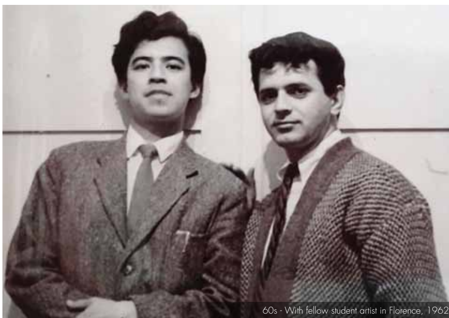
60s - With fellow student artist in Florence, 1962

and became more stylised in appearance before he completely converted into abstraction.