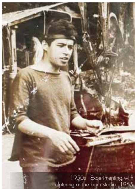
1950s - Experimenting with sculpturing at the barn studio, 1955